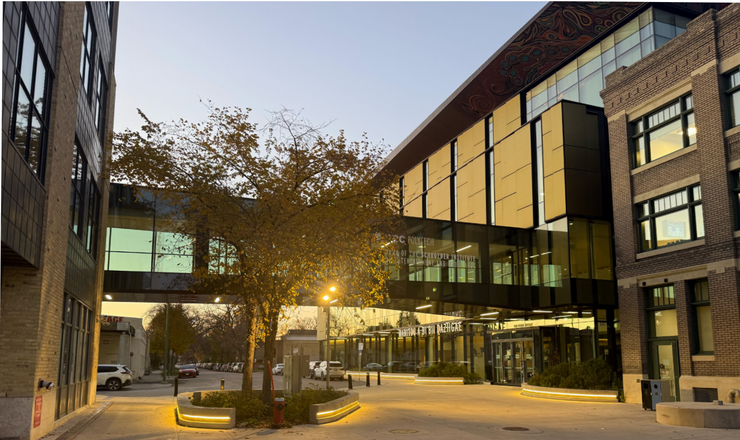
Red River College Polytech campus just steps away from 330 & 340 Elgin Avenue