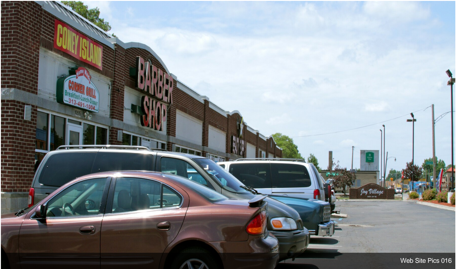
Web Site Pics 016