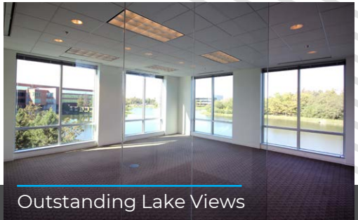
Outstanding Lake Views

All information contained herein is from sources deemed reliable; however, no representation or warranty is made to the accuracy thereof.