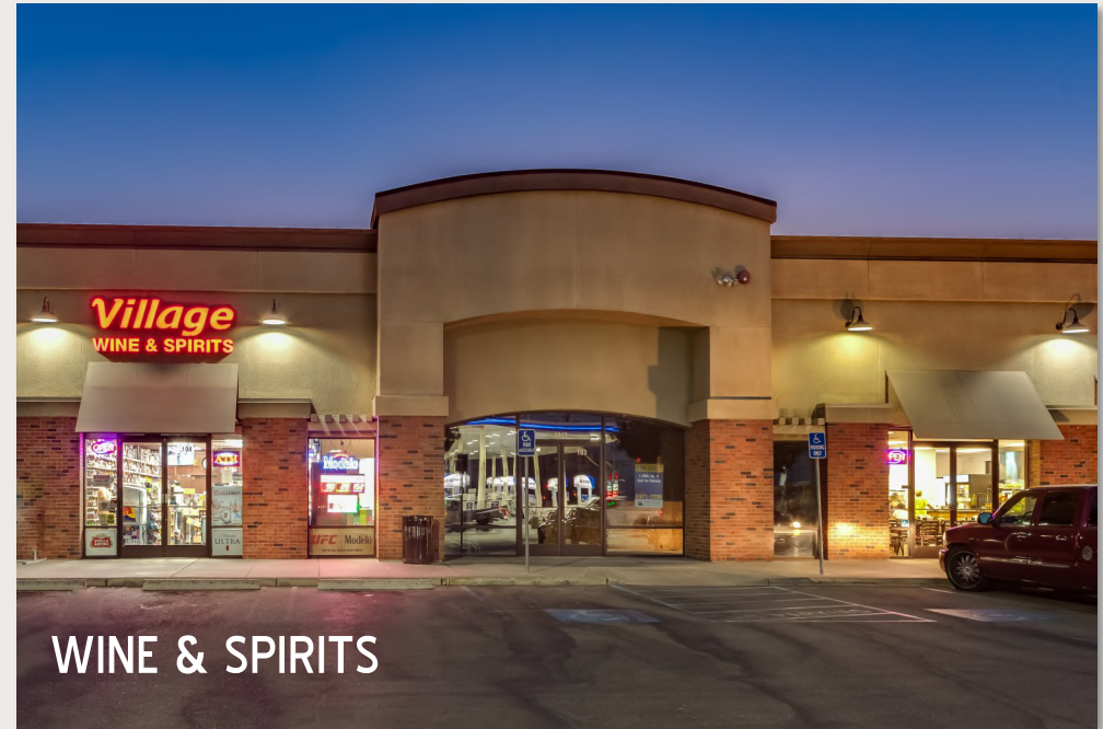
WINE & SPIRITS