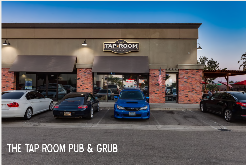
THE TAP ROOM PUB & GRUB