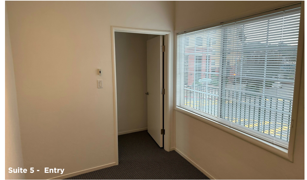
Suite 5 - Entry