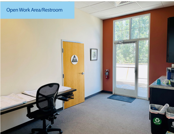
Open Work Area/Restroom