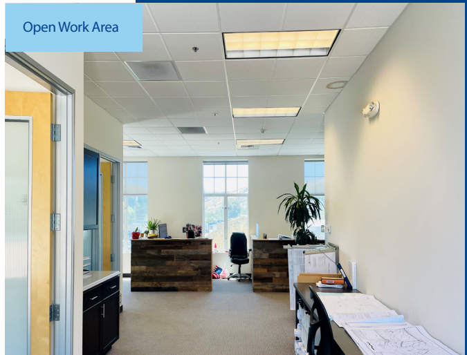
Open Work Area