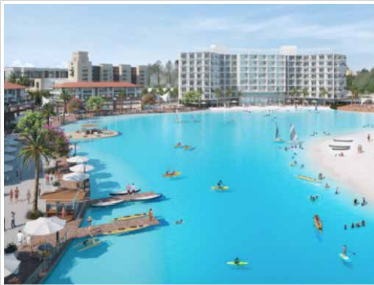
The Austin area is getting a crystal lagoon. Courtesy rendering

A massive new development is underway in the Austin area, promising retail, restaurants, entertainment, a hotel, office and residential space, and 4-acre crystalline lagoon.