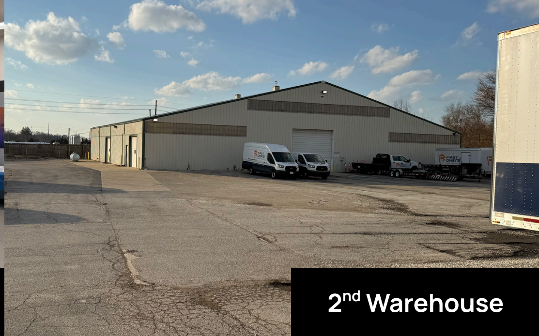
2 nd Warehouse