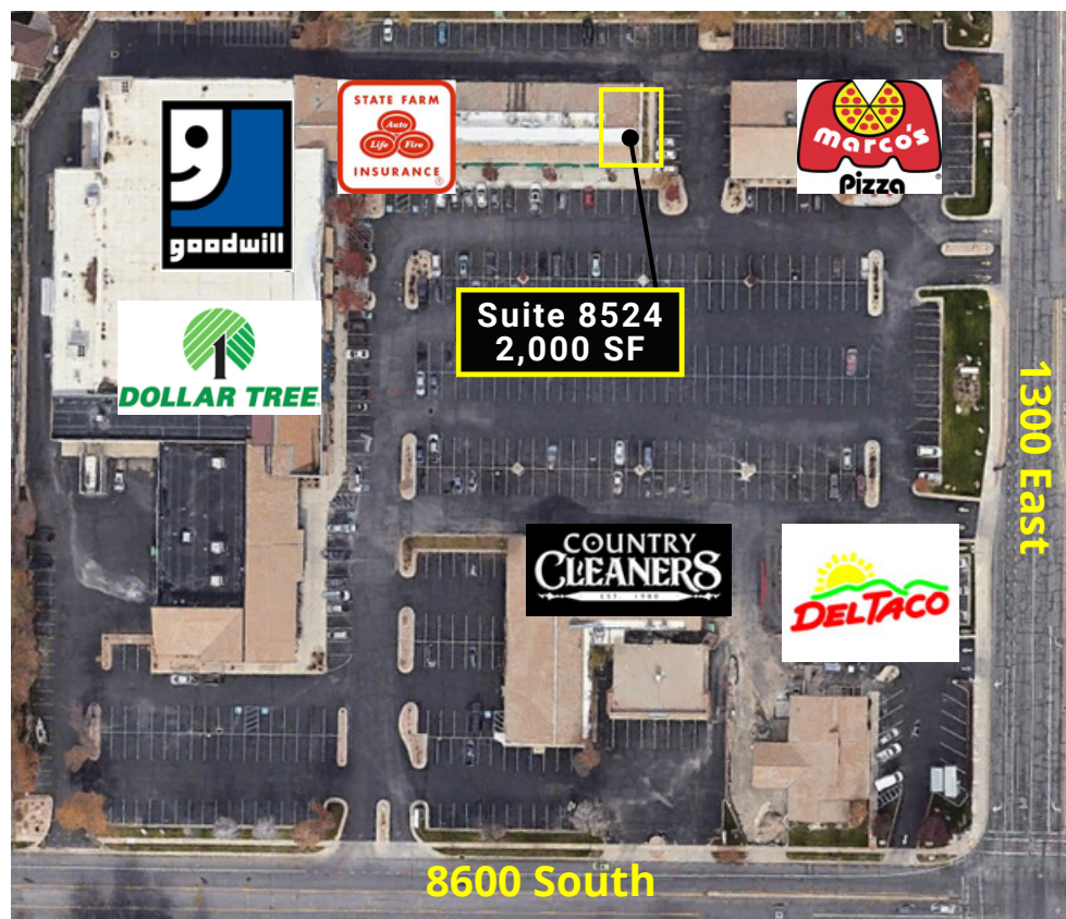
Suite 8524: 2,000 SF