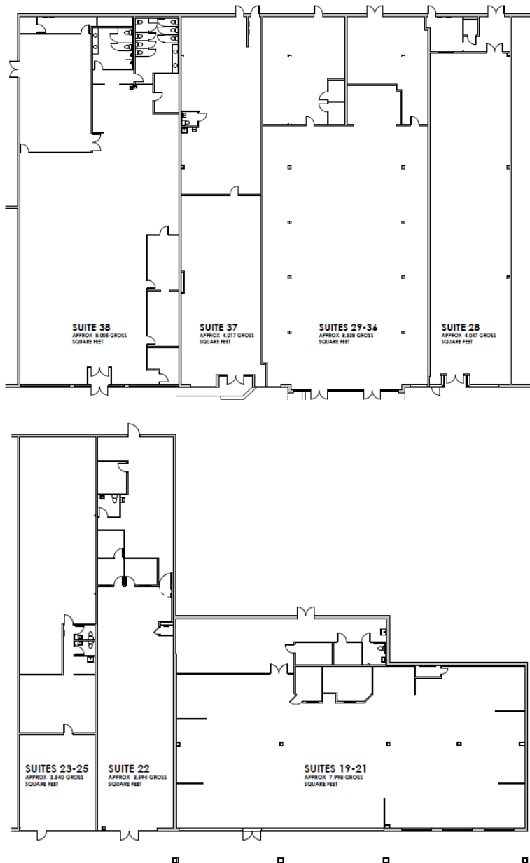
Current Layout of Available Space