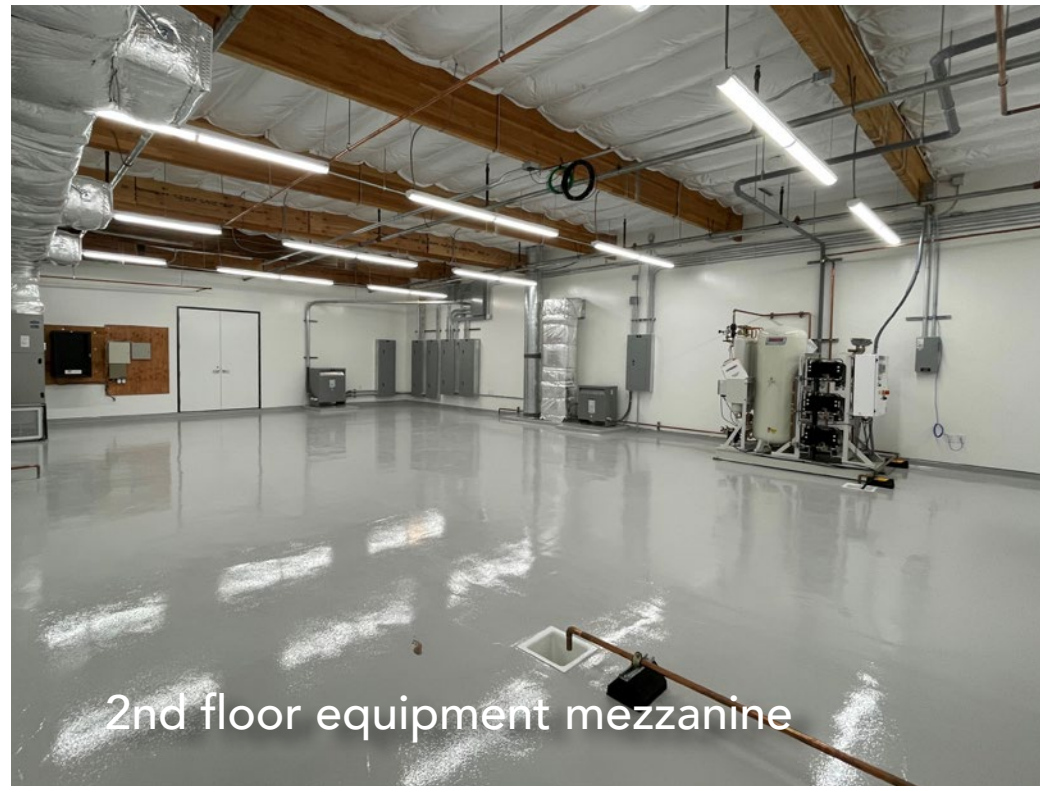
2nd floor equipment mezzanine