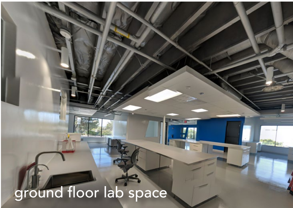
ground floor lab space