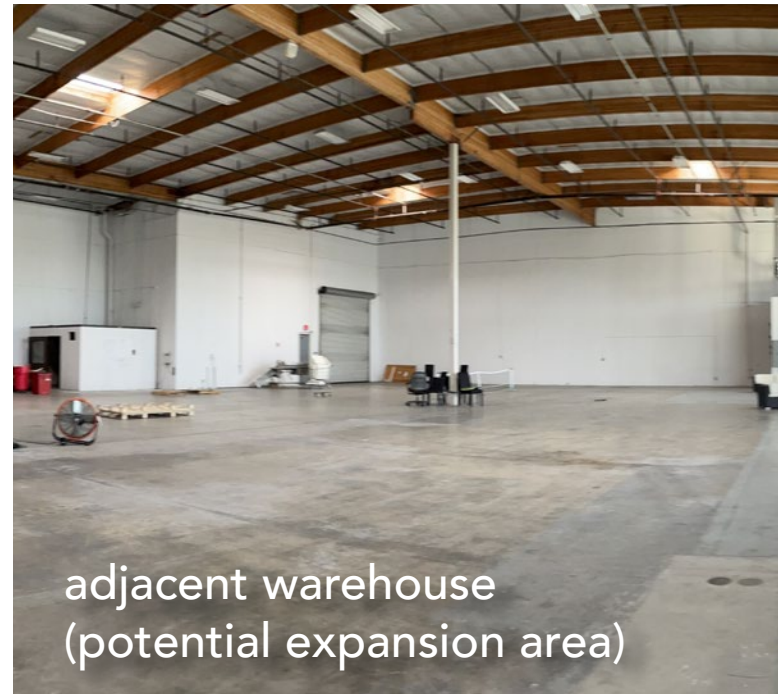
adjacent warehouse (potential expansion area)