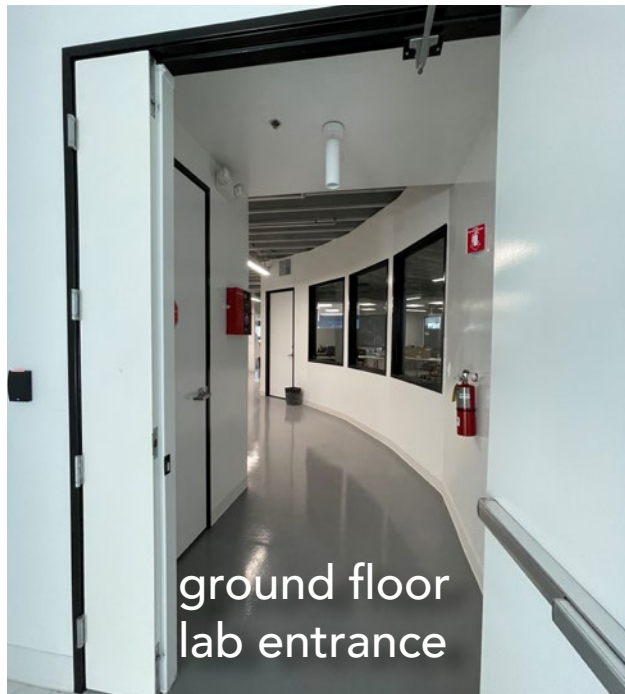
ground floor lab entrance