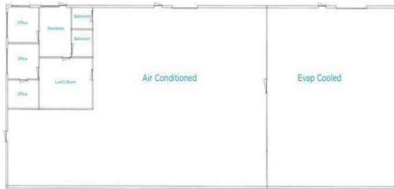
EXHIBIT "A" ORIGINAL FLOOR PLAN

2150 East Highland Avenue, Suite 207, Phoenix, AZ 85016 // 602.955.3500 // cutlercommercial.com