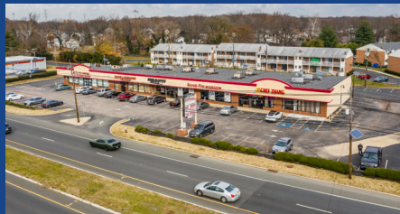
140-150 ROUTE 73 NORTH