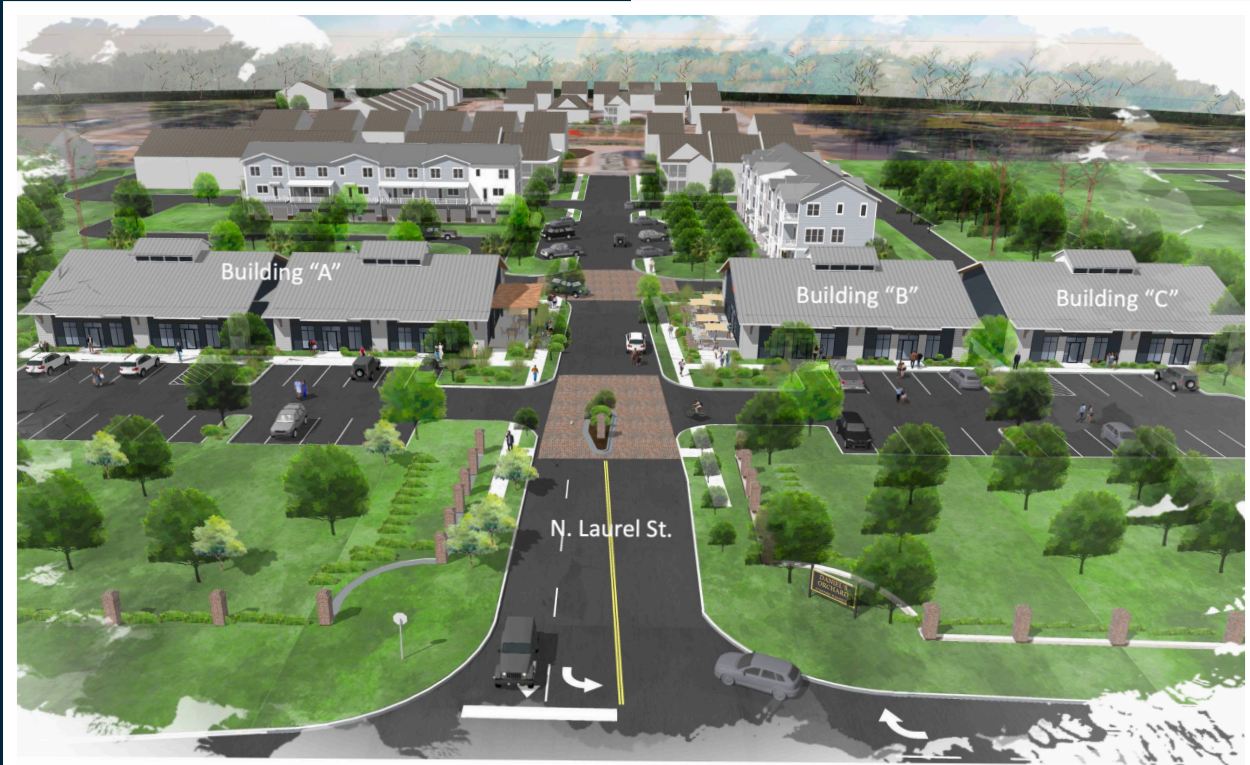
re View from W. 5 th N. St.