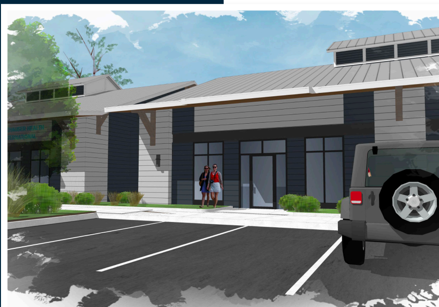
Building "A" Entry from Front Parking Lot (Typical Tenant Entry)