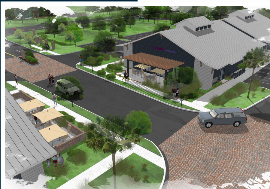
View of Rear Toward Building "A"