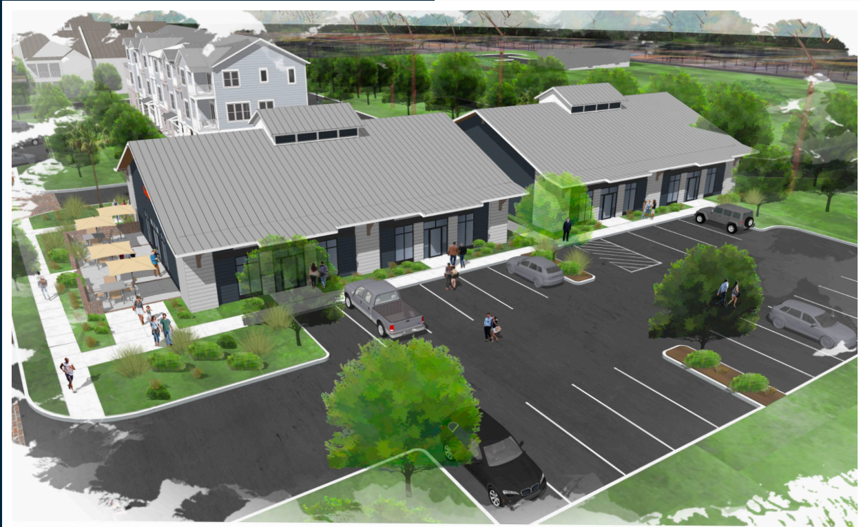
Bird's Eye View of Building "B" & "C"