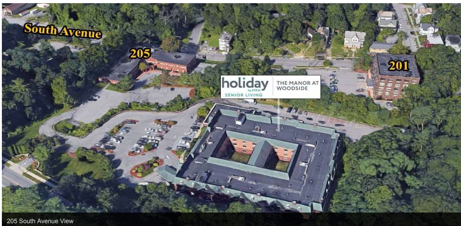
205 South Avenue View