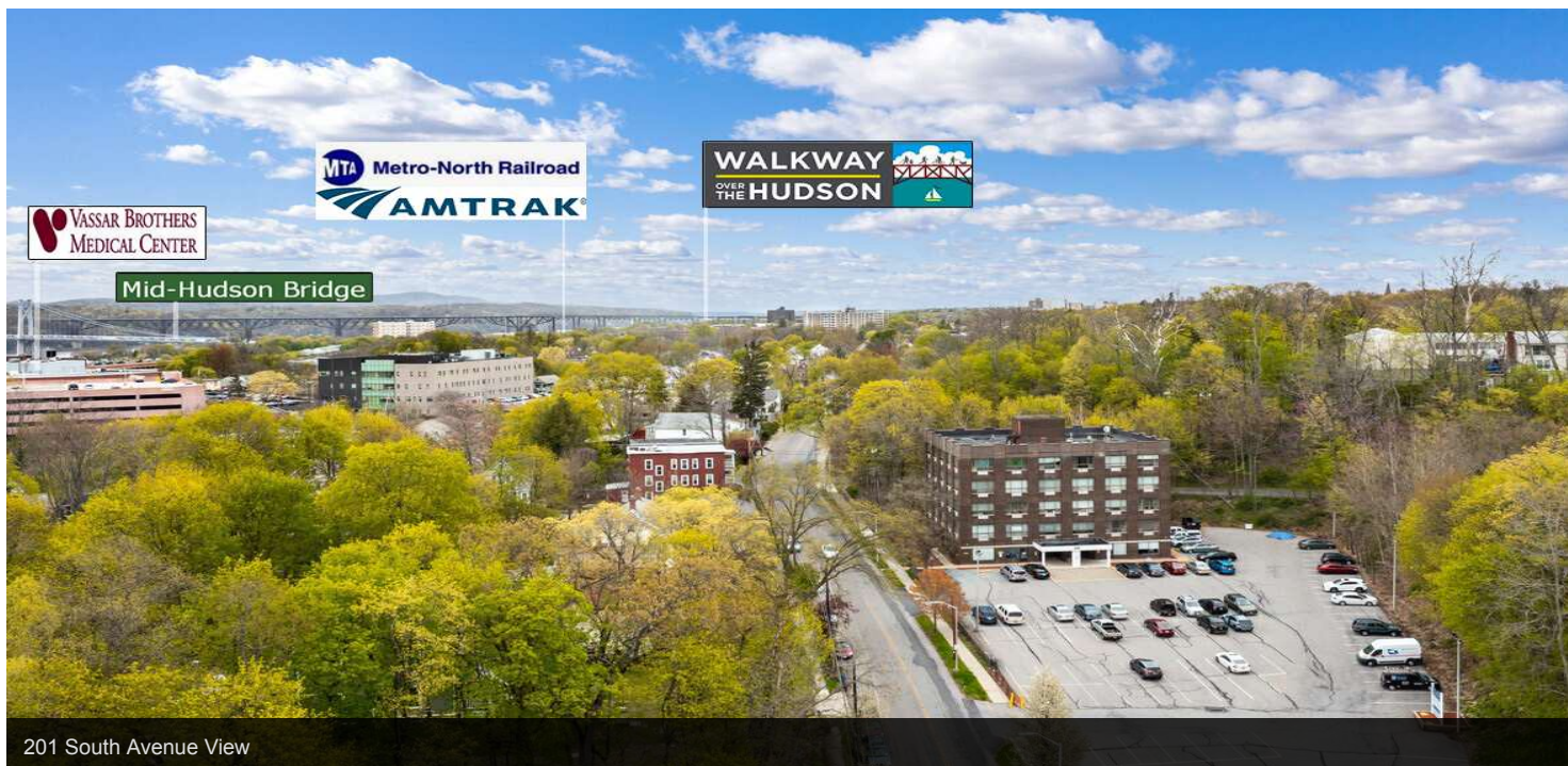
201 South Avenue View

MID HUDSON BRIDGE & U.S. ROUTE 9 - 4 MINUTES AWAY