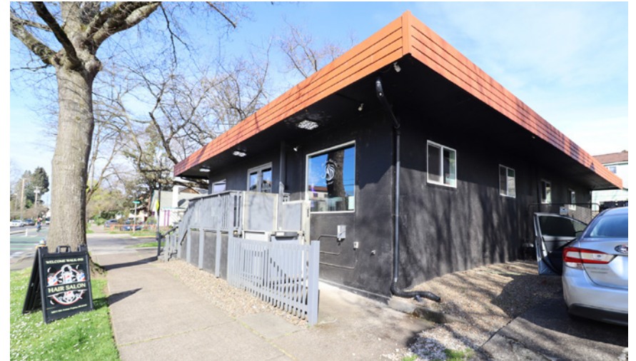
ADA ENTRY WITH LIFT ACCESS INSTALLED