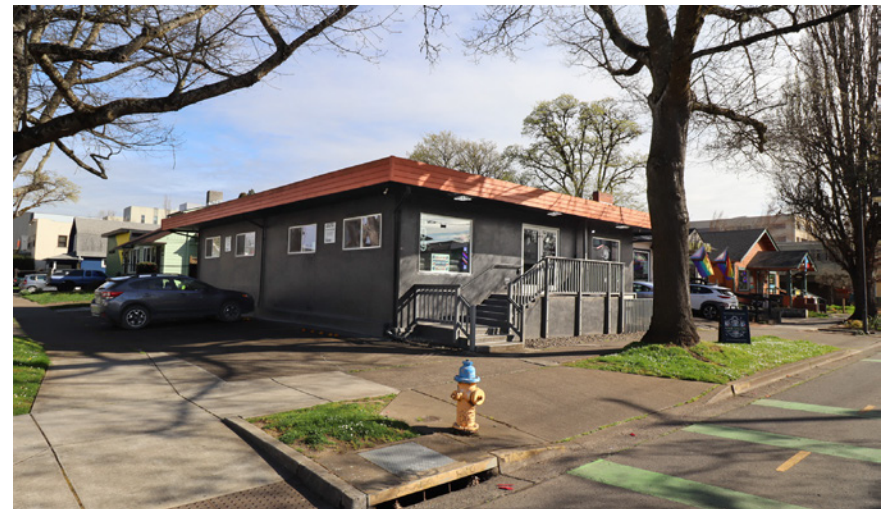
HIGH-VISIBILITY CORNER LOCATION NEAR CAMPUS