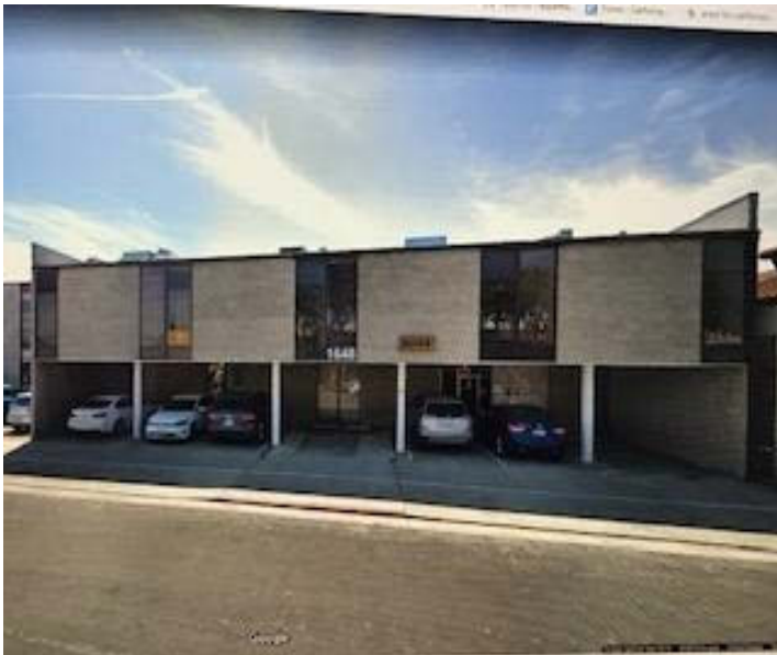
1648 10th St – First Floor Plan Approximately 6000 sq.ft.

Other Info - Offered for Sale as well - Owner may carry Price: $7,950,000.