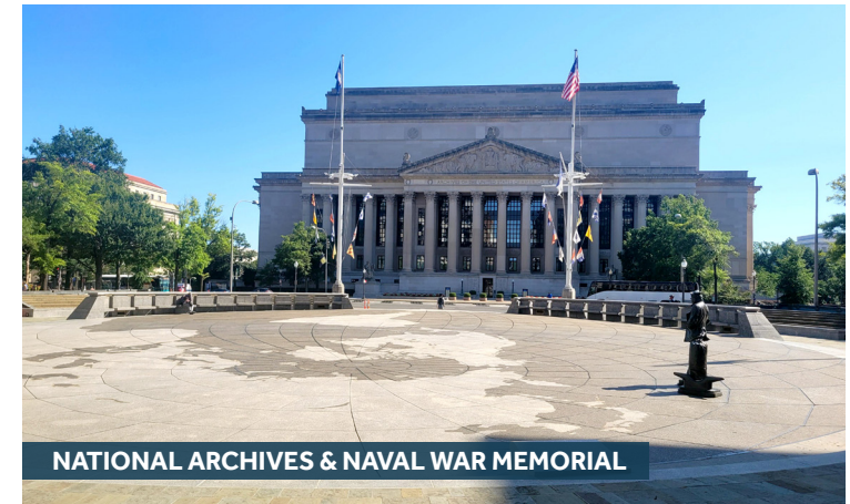
NATIONAL ARCHIVES & NAVAL WAR MEMORIAL