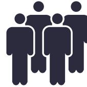
2024 DAYTIME POPULATION