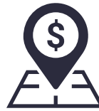
2024 AVERAGE HOUSEHOLD INCOMES