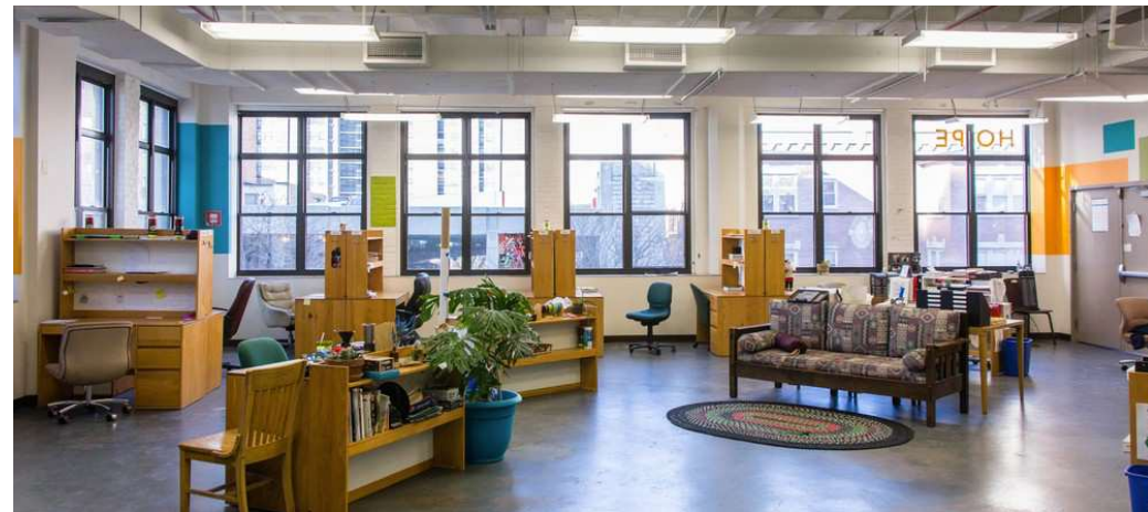
Great Natural Light