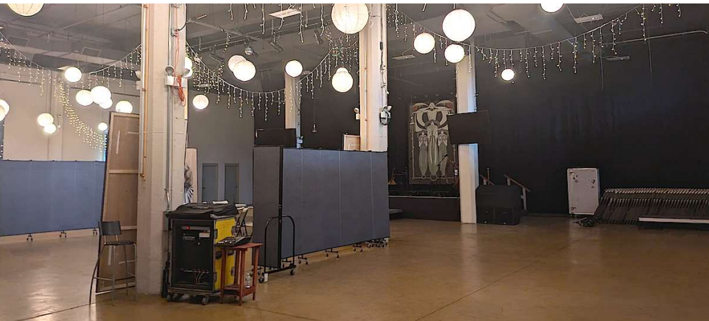
500 Person Venue

Office/Creative/Classroom Space For Lease in Uptown