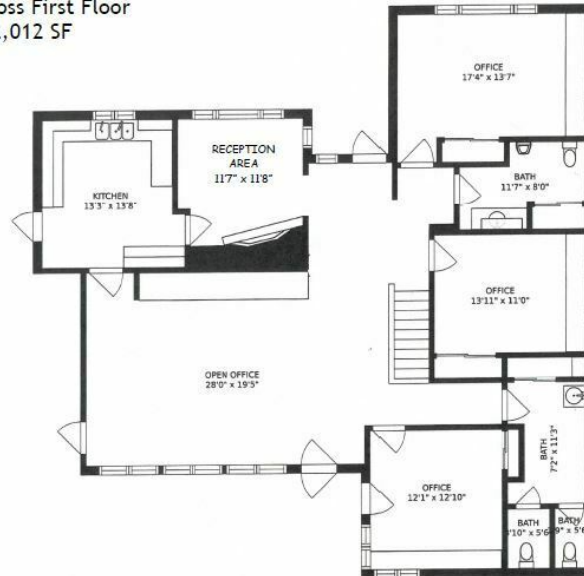
Gross First Floor ± 2,012 SF

SIZES AND DIMENSIONS ARE APPROXIMATE. ACTUAL MAY VARY.