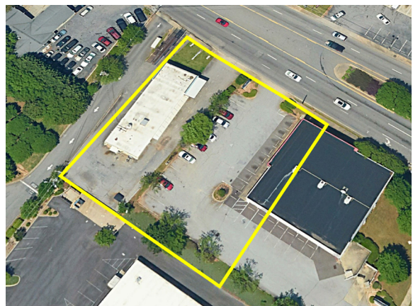
GREENVILLE COUNTY TAX MAP #0266000128503

864.729.4500 | PO BOX 9776, GREENVILLE, SC 29604