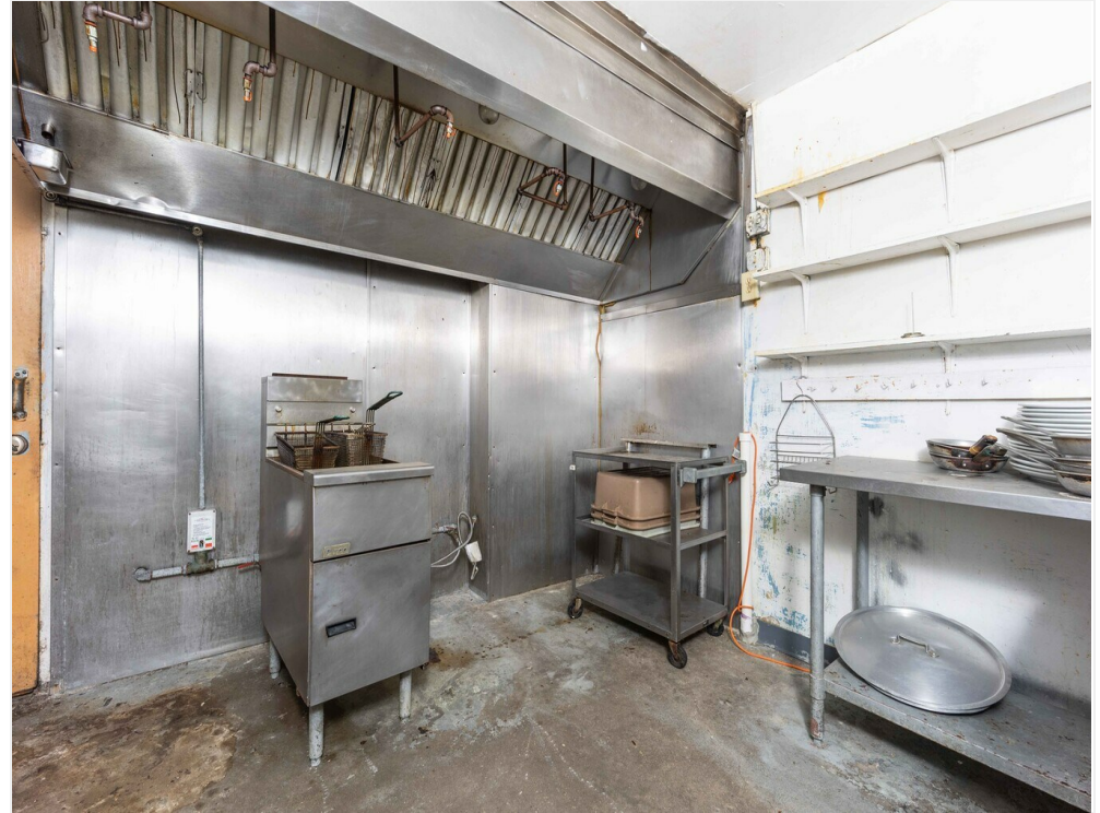
GatewayREP (36 of 53)