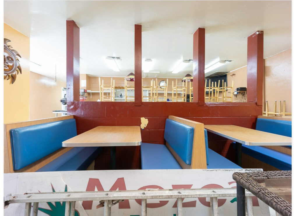
GatewayREP (24 of 53)