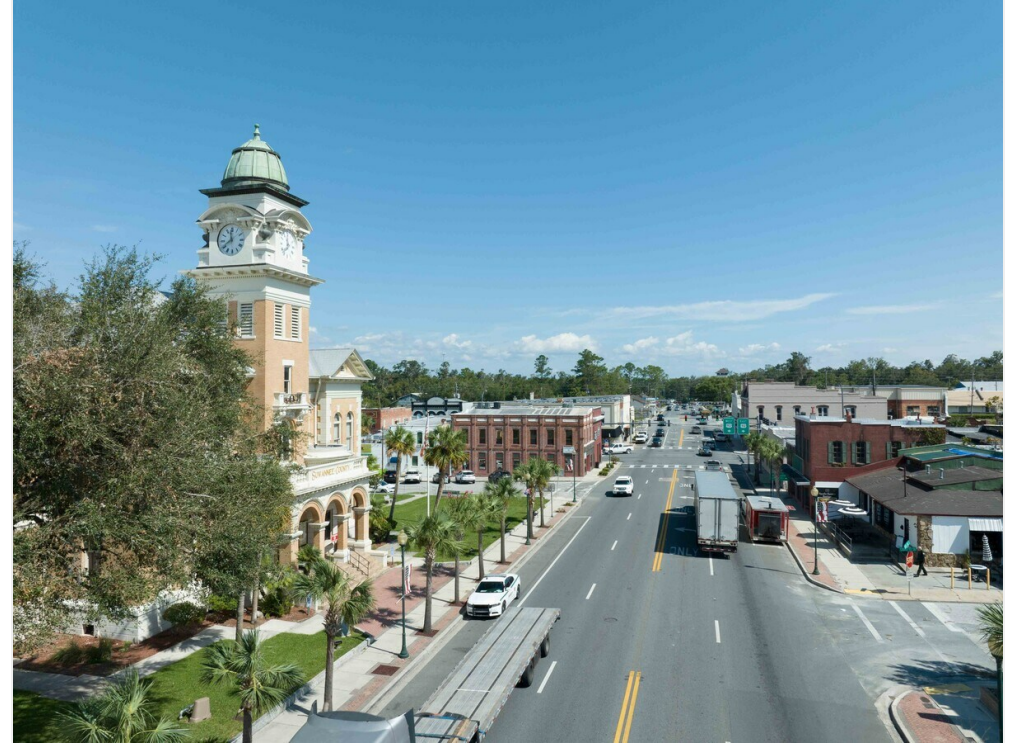
GatewayREP (53 of 53)