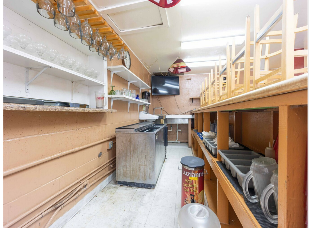
GatewayREP (30 of 53)