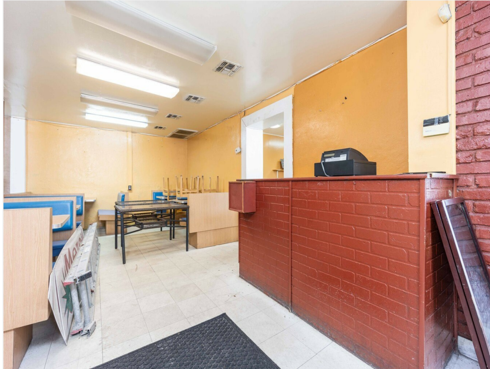
GatewayREP (23 of 53)