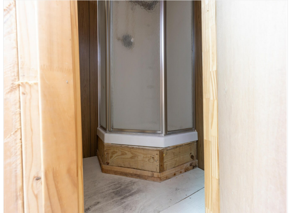
GatewayREP (18 of 53)