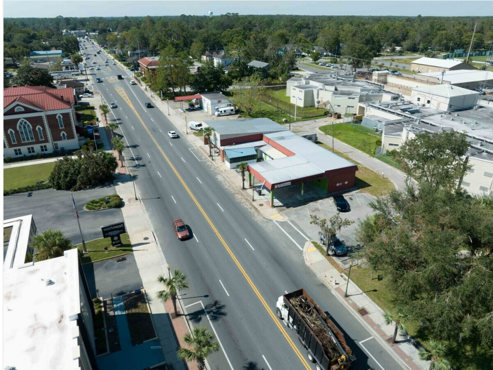
GatewayREP (45 of 53)