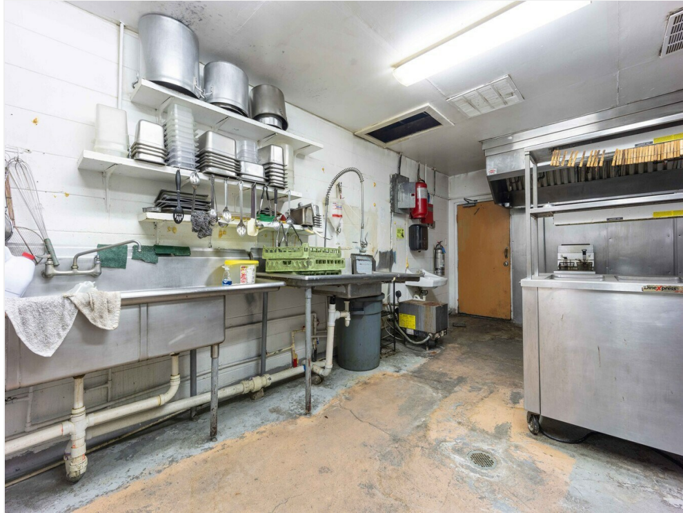
GatewayREP (35 of 53)