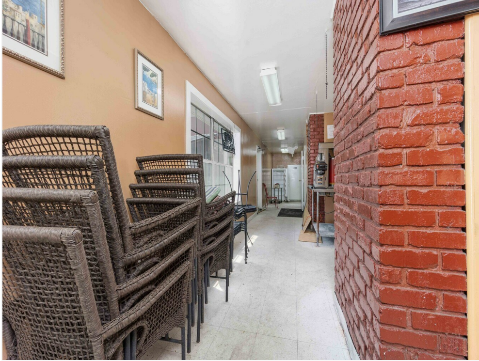
GatewayREP (21 of 53)