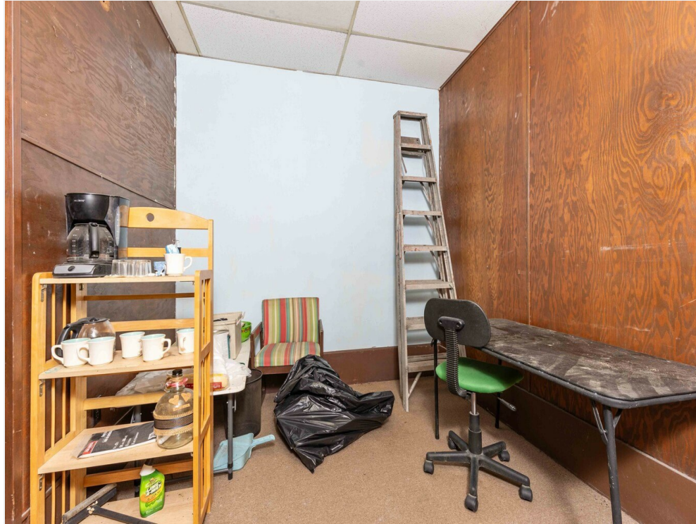
GatewayREP (5 of 53)