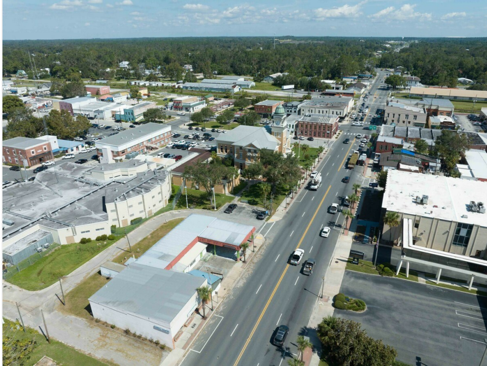
GatewayREP (47 of 53)