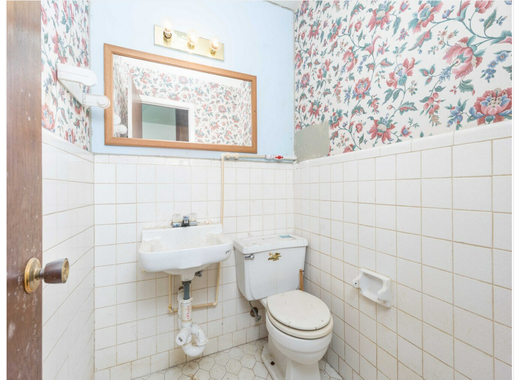
GatewayREP (12 of 53)