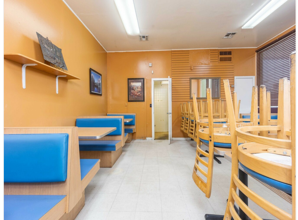
GatewayREP (26 of 53)