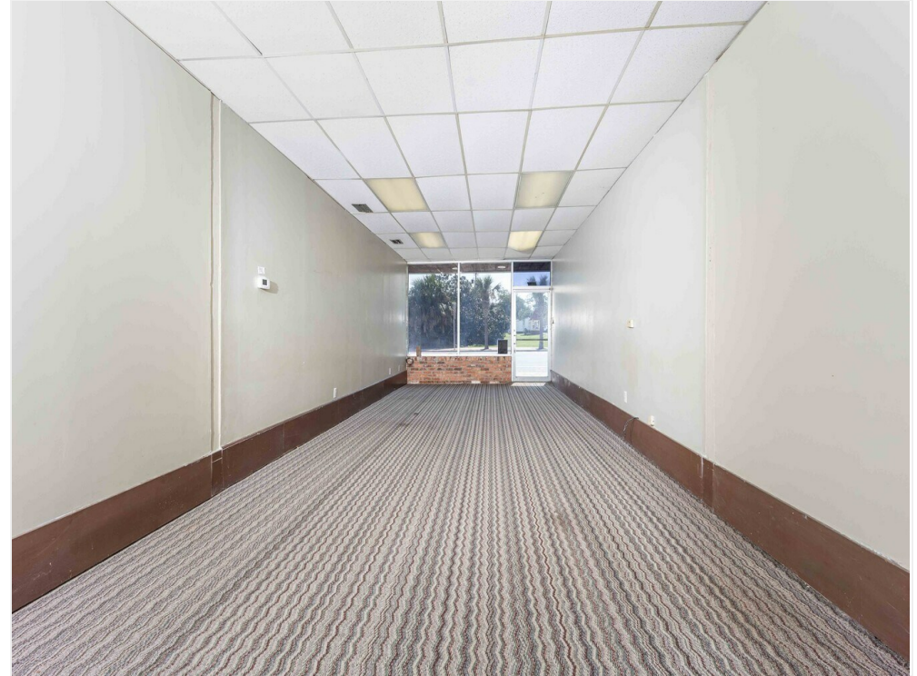
GatewayREP (10 of 53)