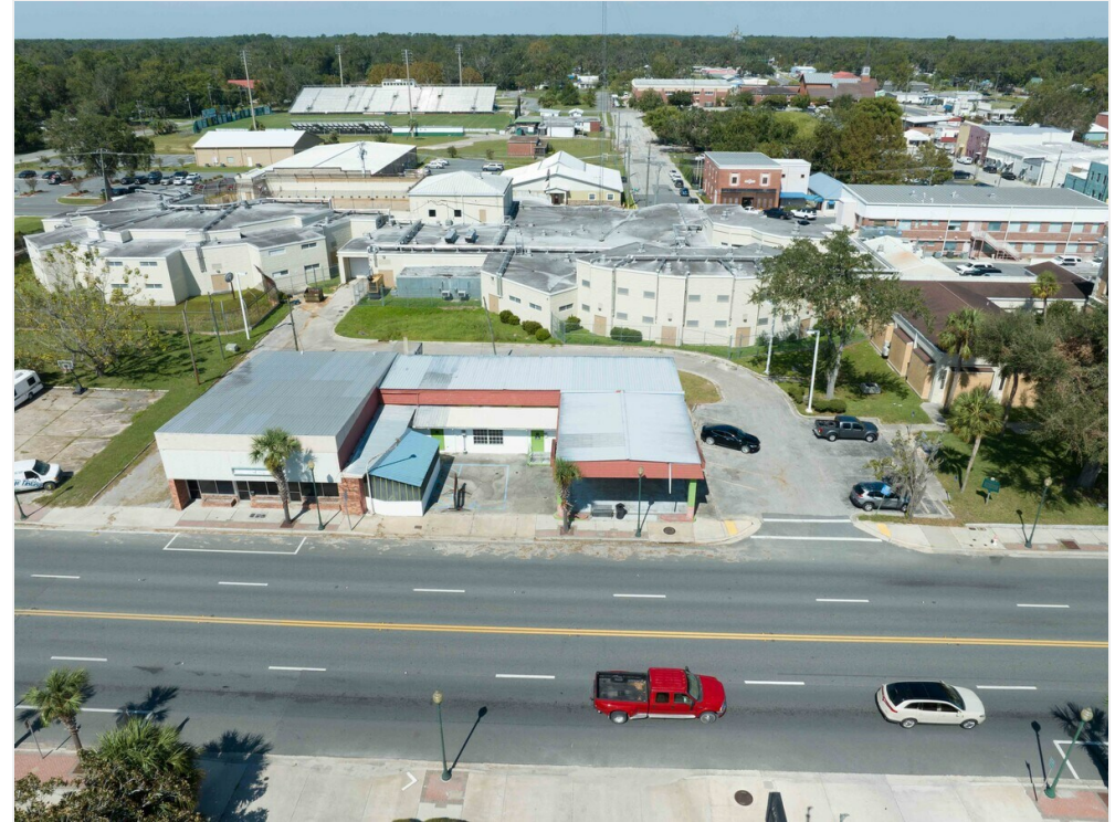
GatewayREP (44 of 53)