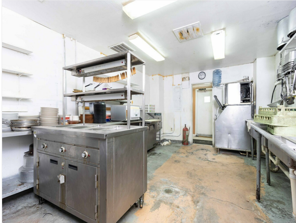
GatewayREP (37 of 53)