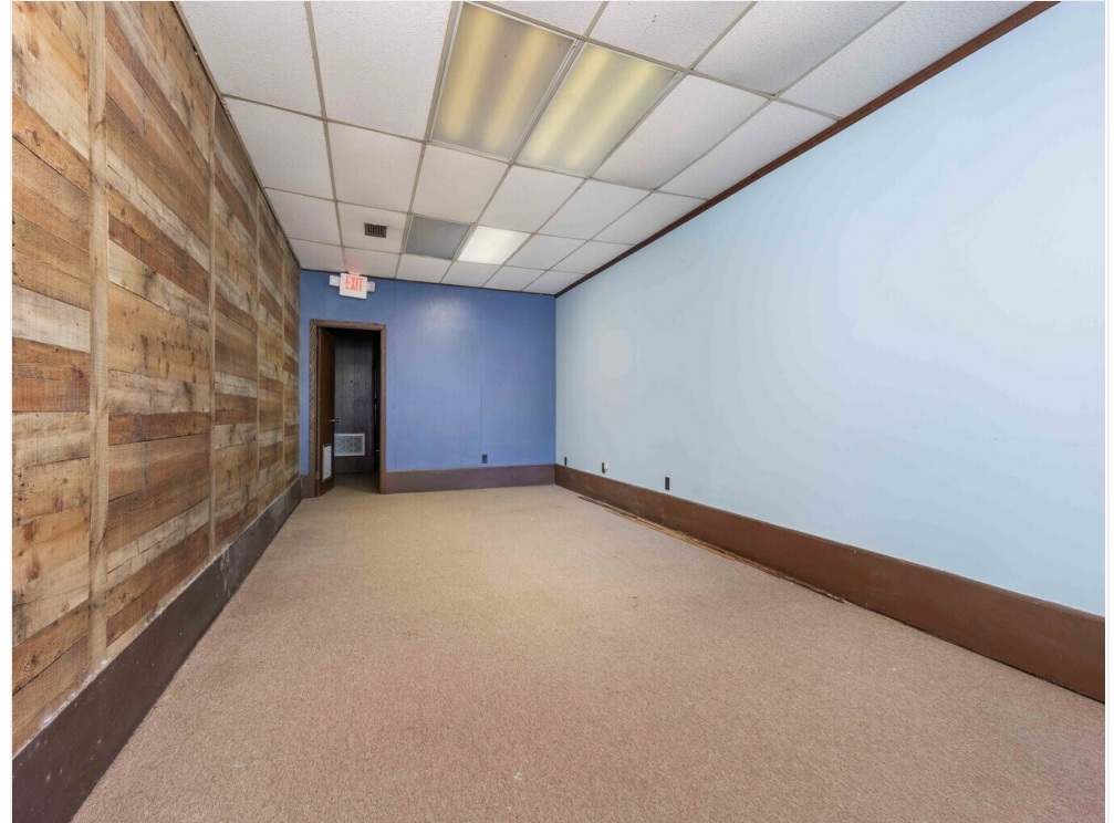
GatewayREP (2 of 53)