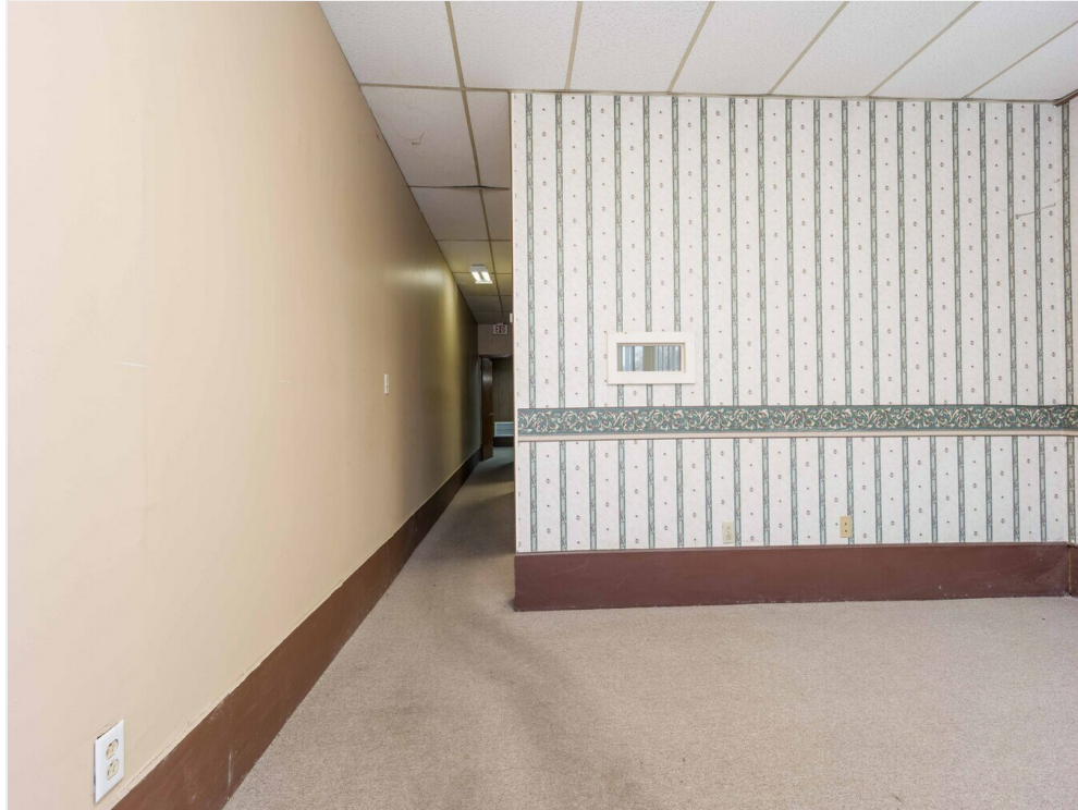
GatewayREP (15 of 53)