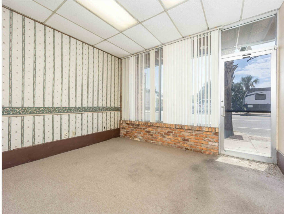
GatewayREP (13 of 53)