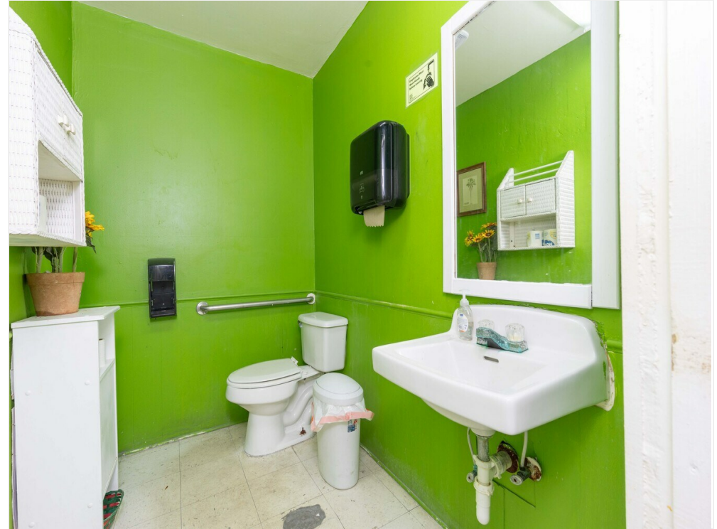
GatewayREP (38 of 53)