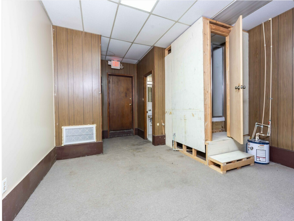
GatewayREP (17 of 53)