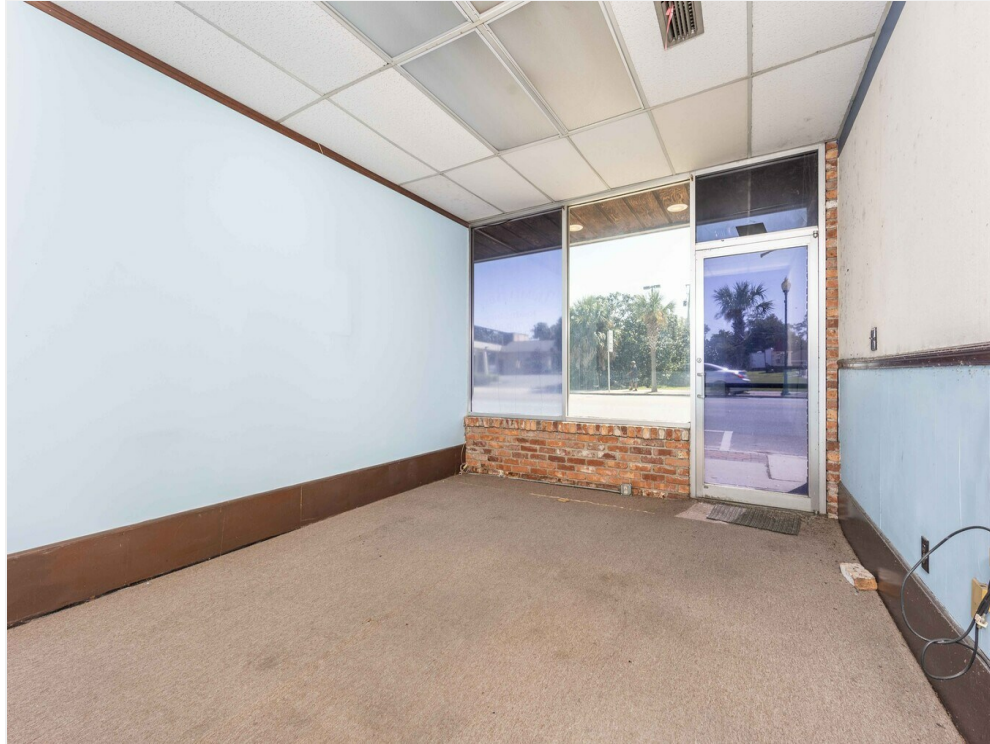
GatewayREP (1 of 53)