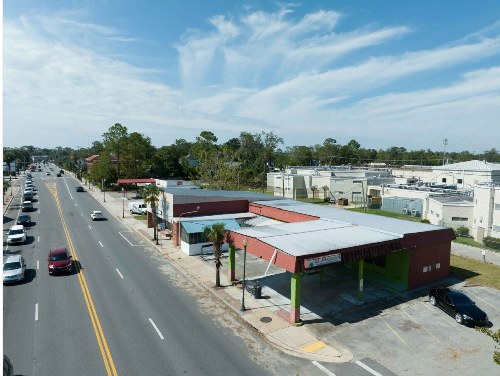
GatewayREP (52 of 53)