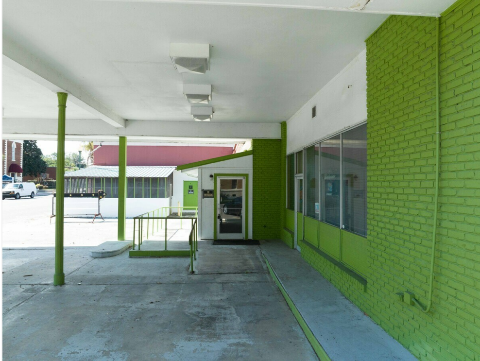
GatewayREP (41 of 53)