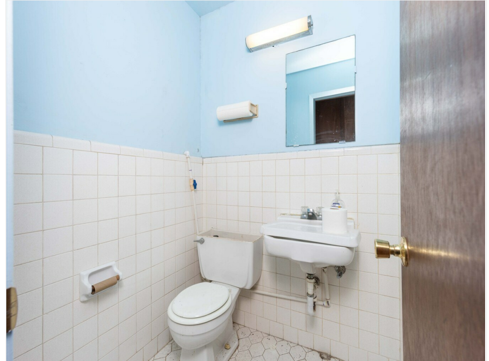
GatewayREP (6 of 53)