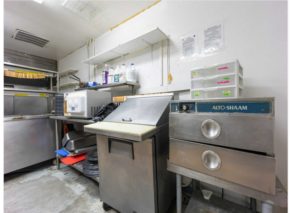
GatewayREP (34 of 53)