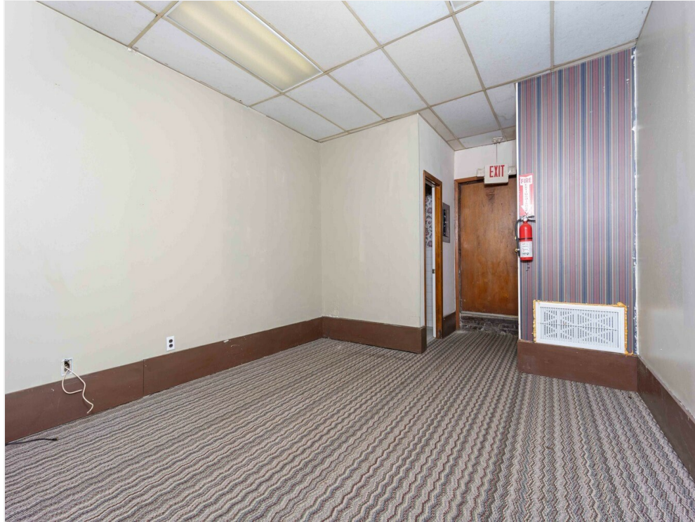
GatewayREP (11 of 53)