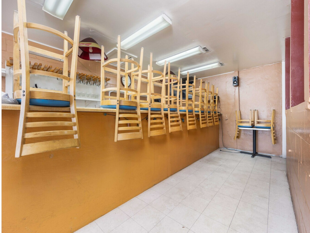
GatewayREP (29 of 53)