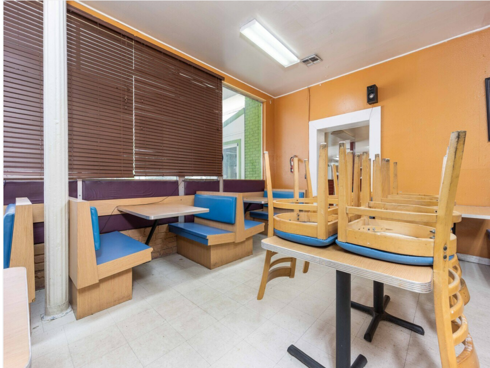
GatewayREP (27 of 53)