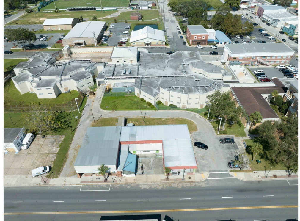
GatewayREP (48 of 53)