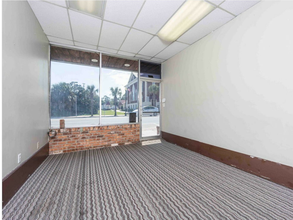
GatewayREP (9 of 53)