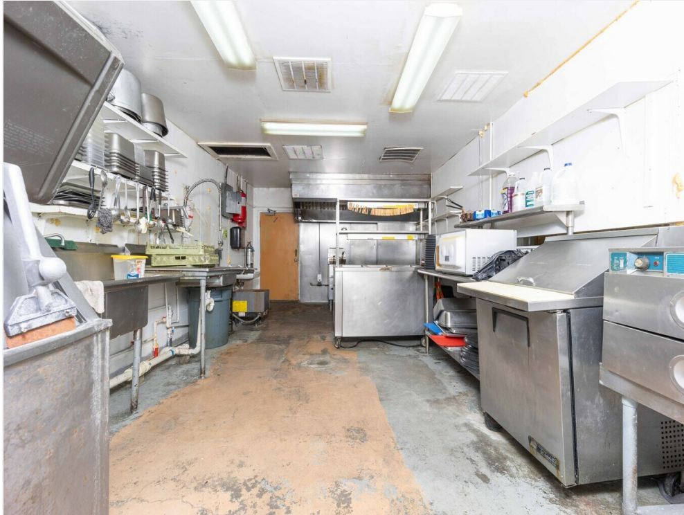
GatewayREP (33 of 53)