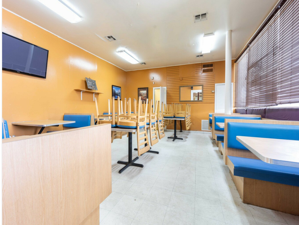
GatewayREP (25 of 53)