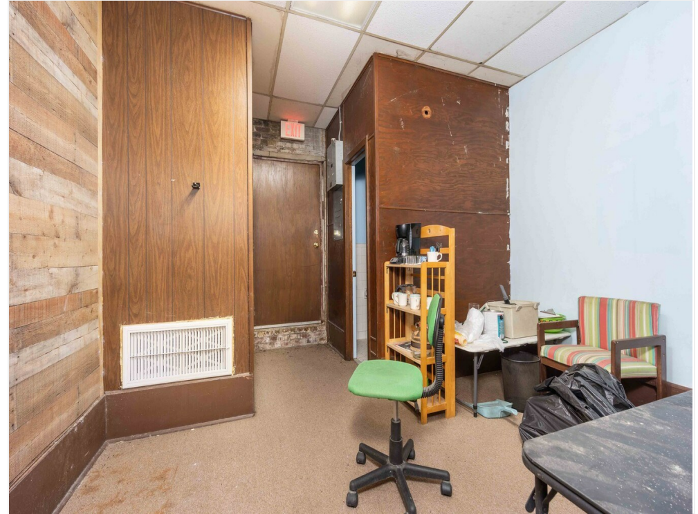
GatewayREP (4 of 53)