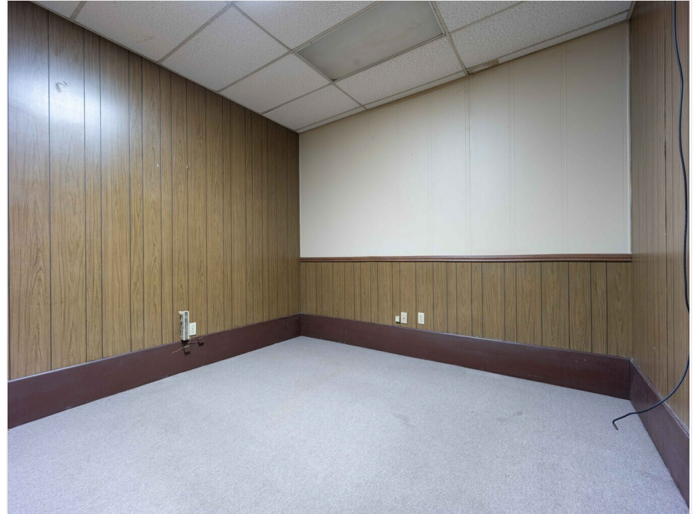
GatewayREP (16 of 53)