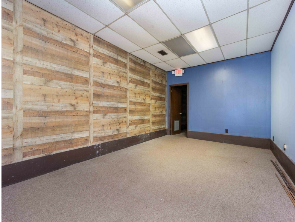
GatewayREP (3 of 53)