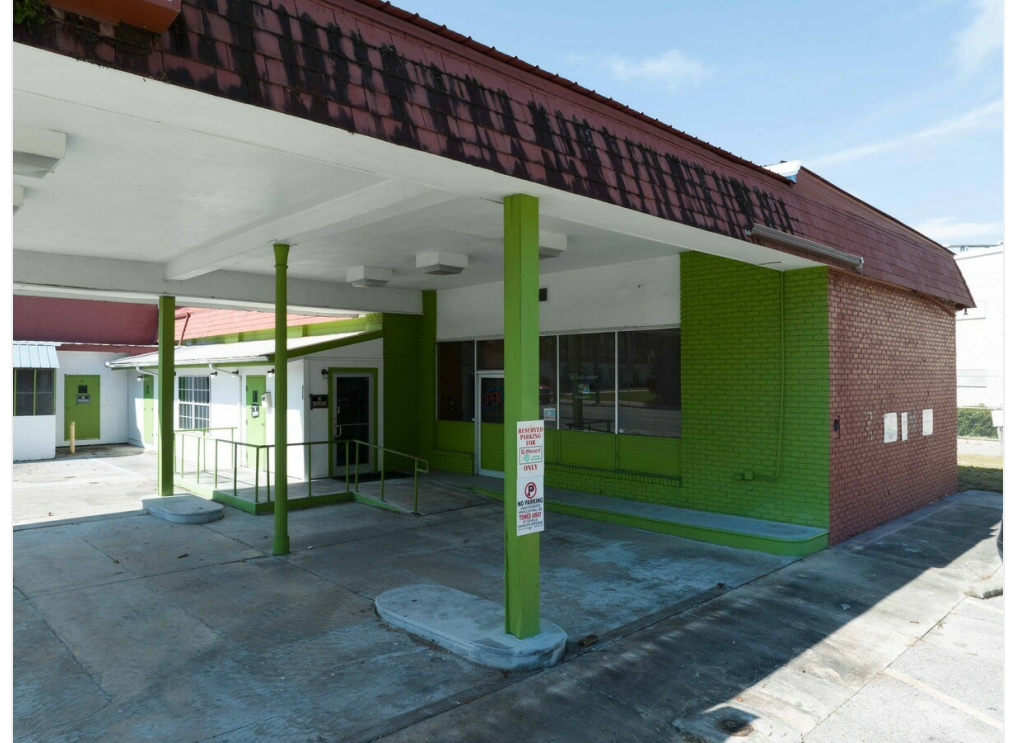
GatewayREP (42 of 53)