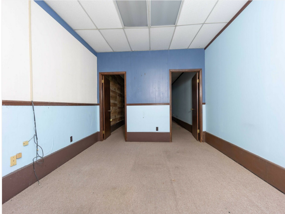
GatewayREP (7 of 53)