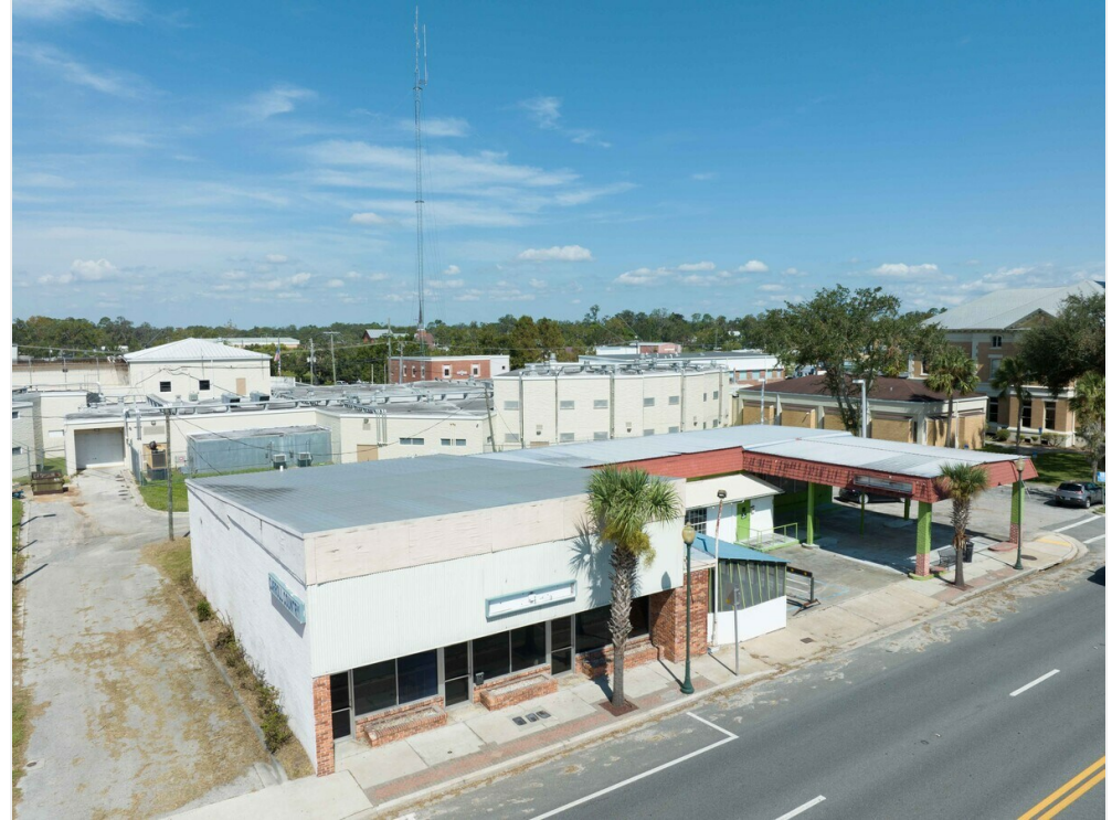
GatewayREP (51 of 53)