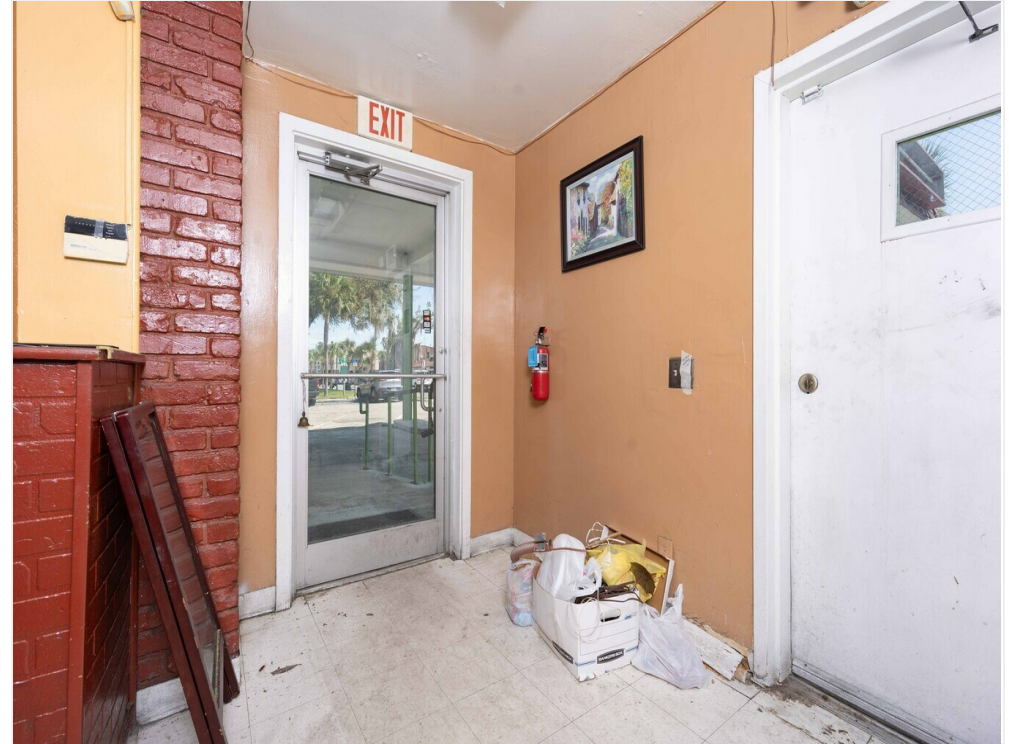
GatewayREP (20 of 53)