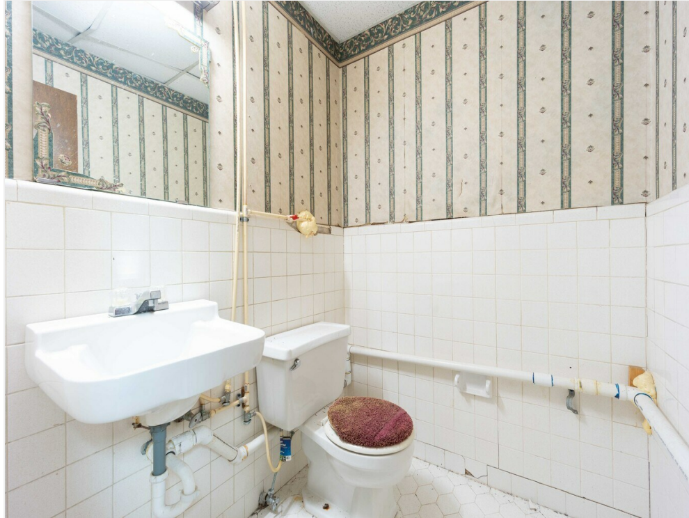
GatewayREP (19 of 53)