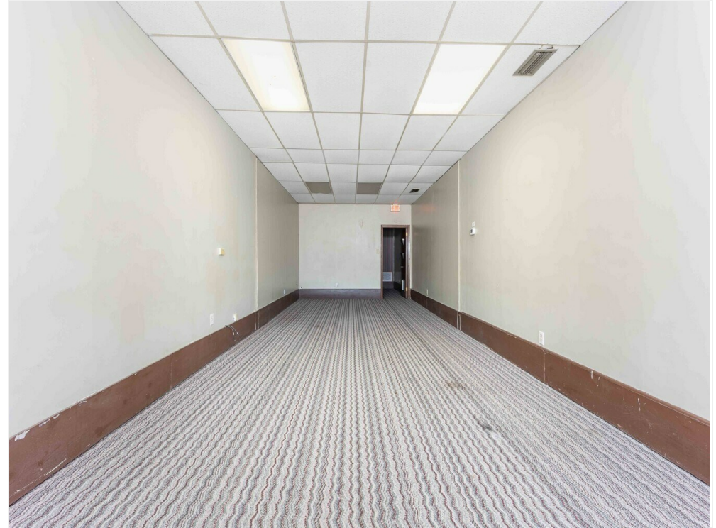
GatewayREP (8 of 53)