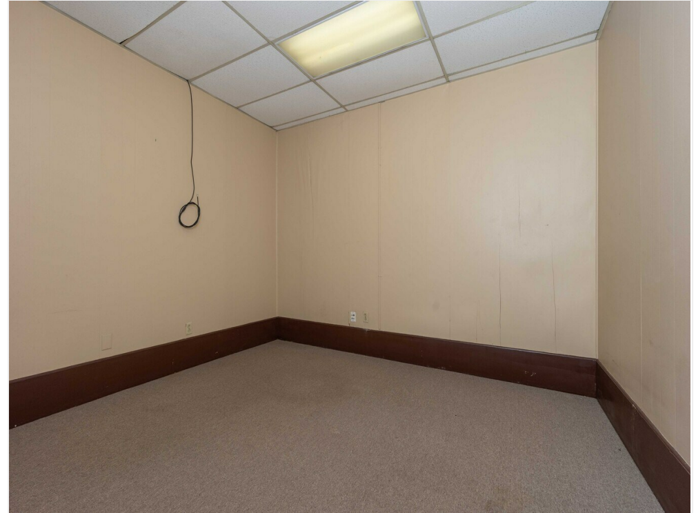
GatewayREP (14 of 53)