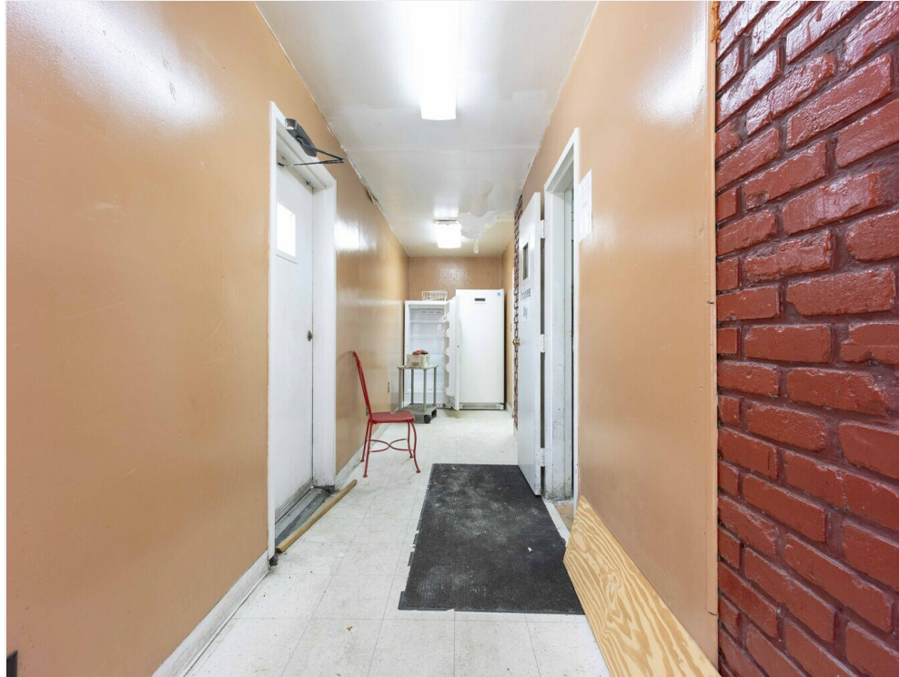
GatewayREP (31 of 53)