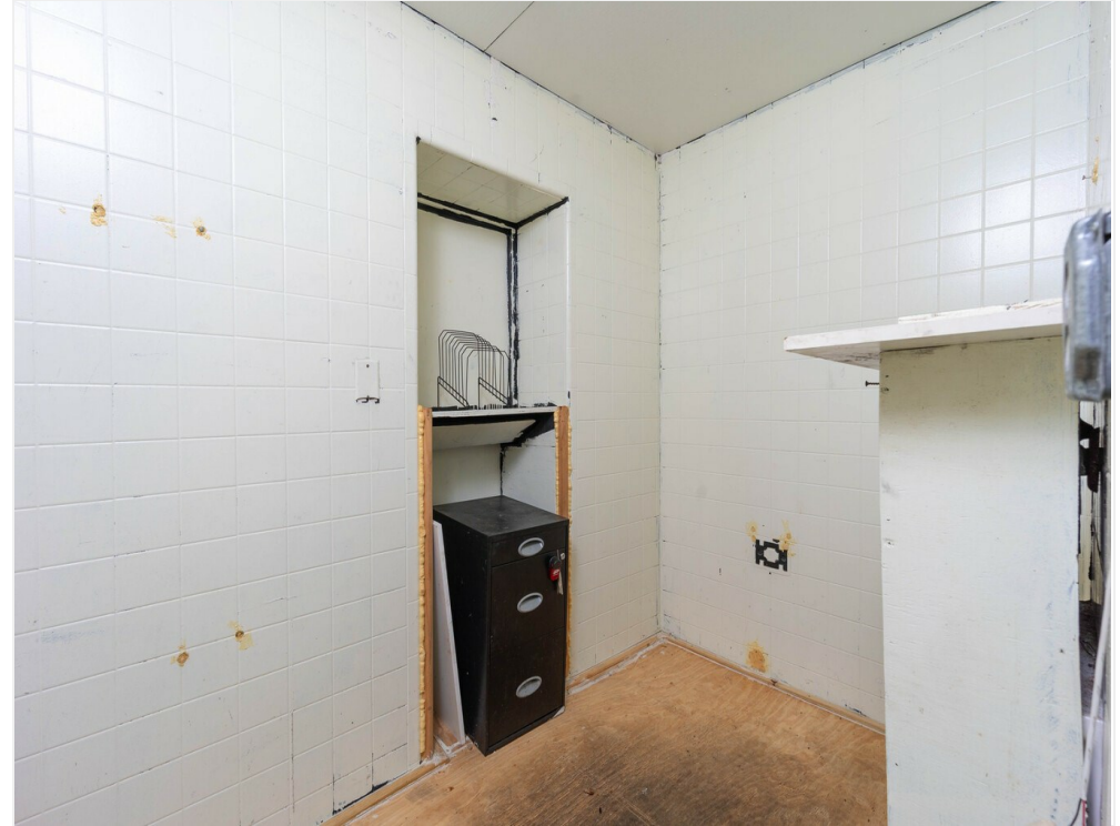
GatewayREP (28 of 53)