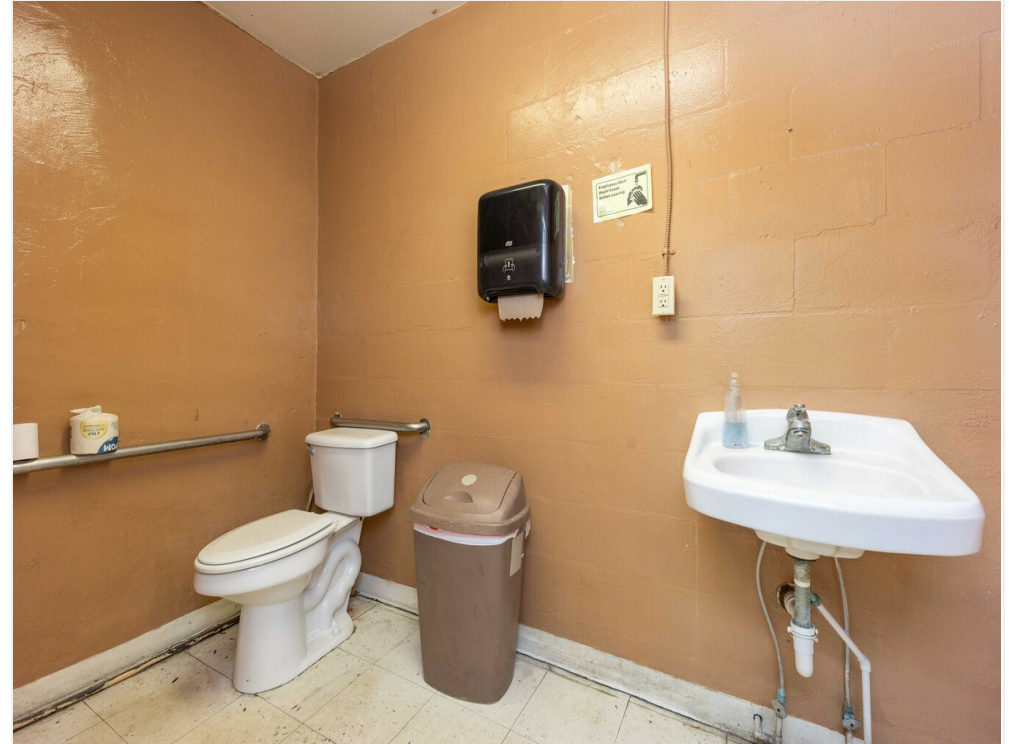
GatewayREP (40 of 53)