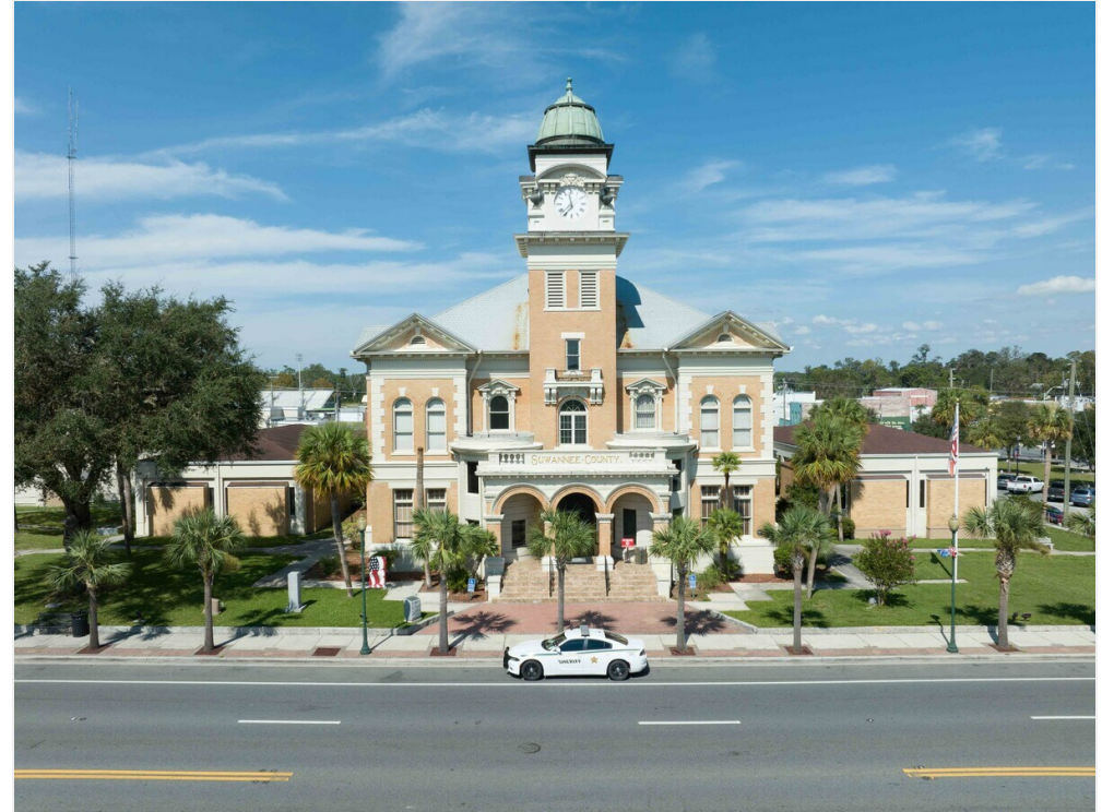
GatewayREP (46 of 53)