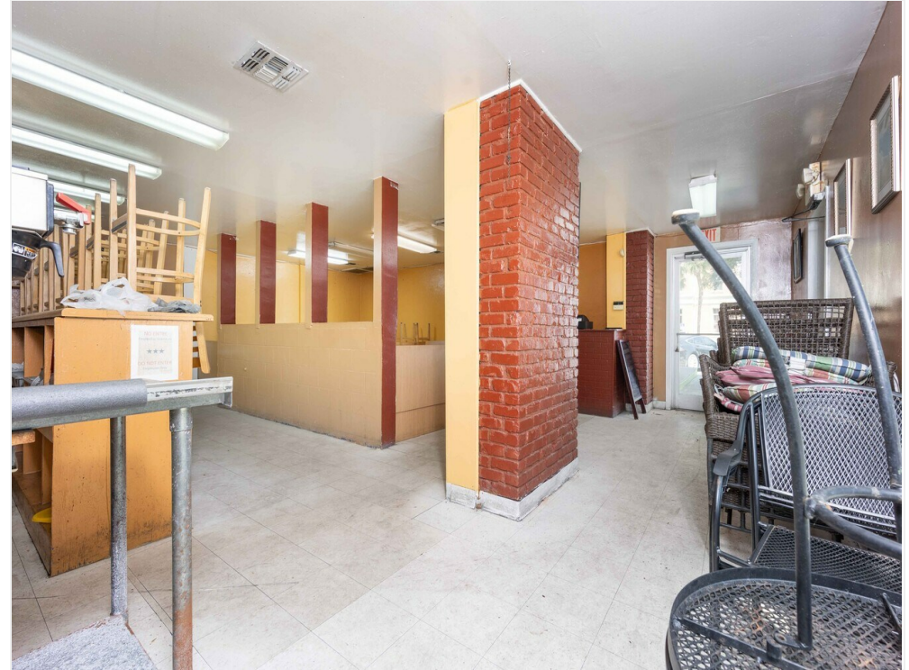
GatewayREP (32 of 53)