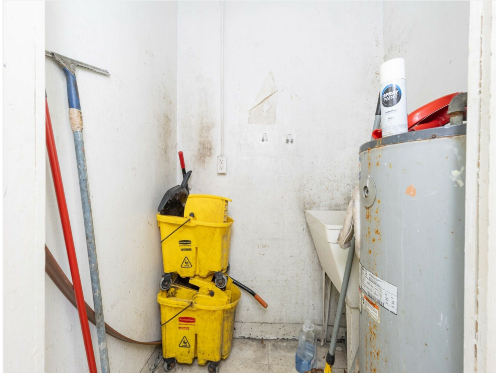
GatewayREP (39 of 53)