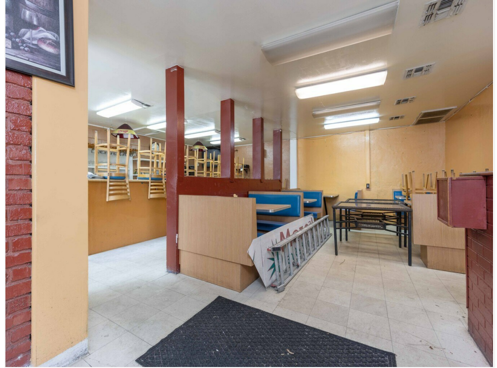
GatewayREP (22 of 53)