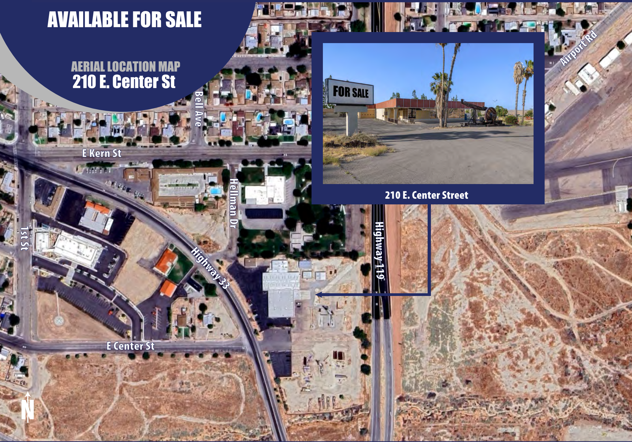
210 E. Center Street