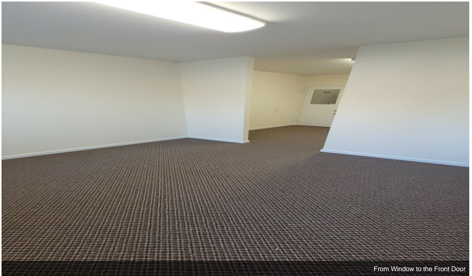
From Window to the Front Door