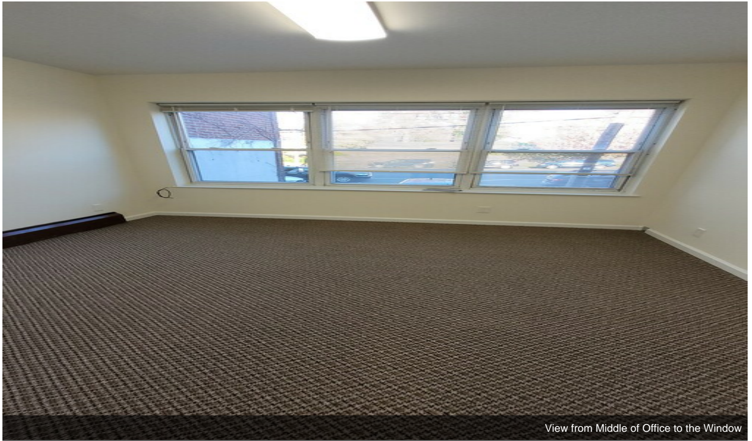
View from Middle of Office to the Window