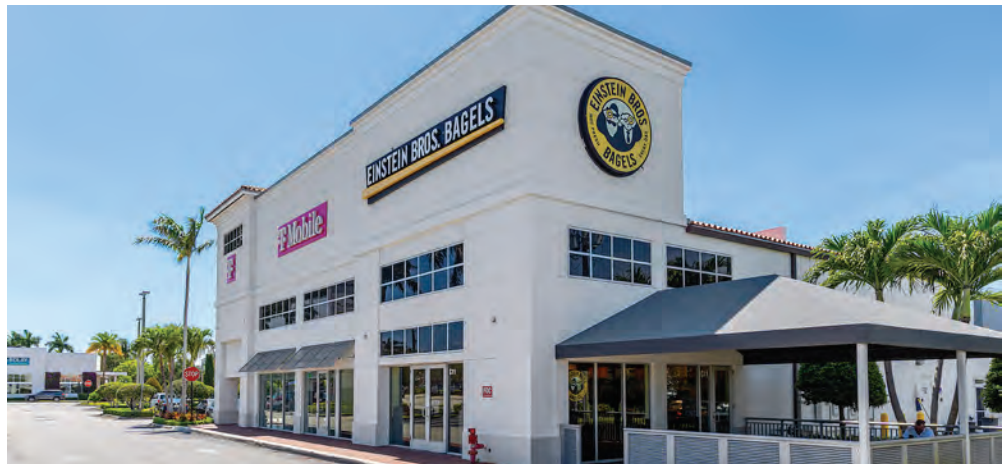
PALM BEACH MARKETPLACE