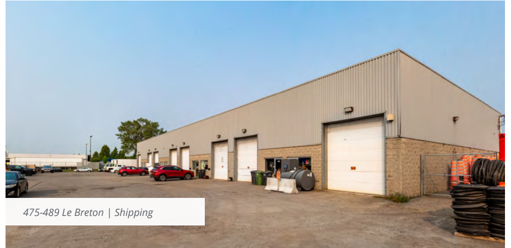
475-489 Le Breton | Shipping