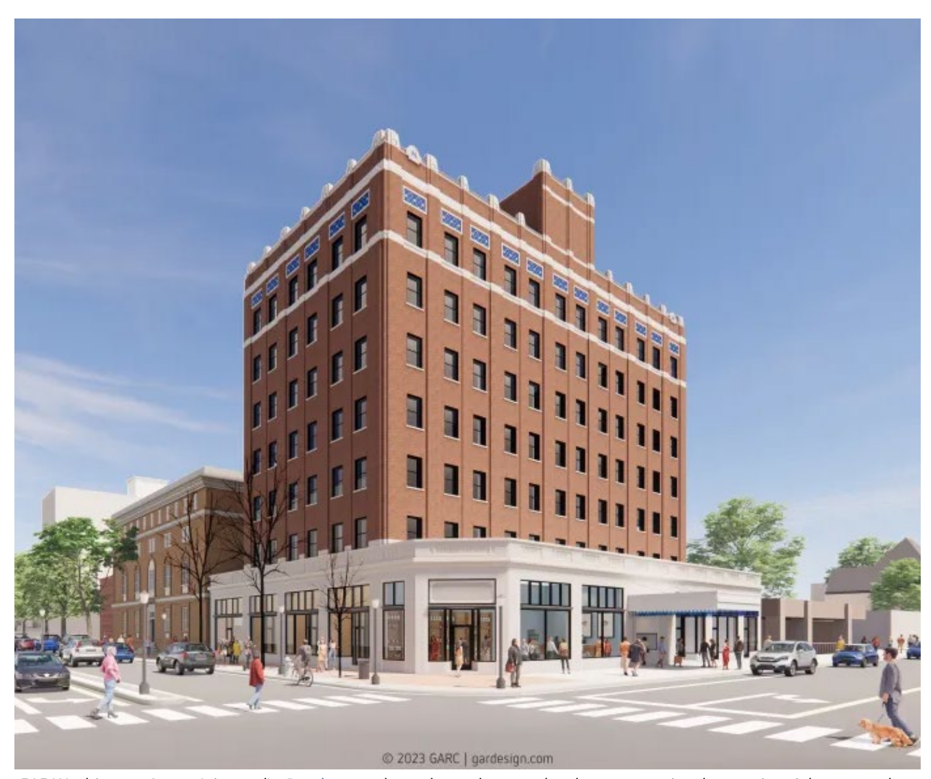
505 Washington Street (pictured) - Read more about the real estate development project happening right across the street.