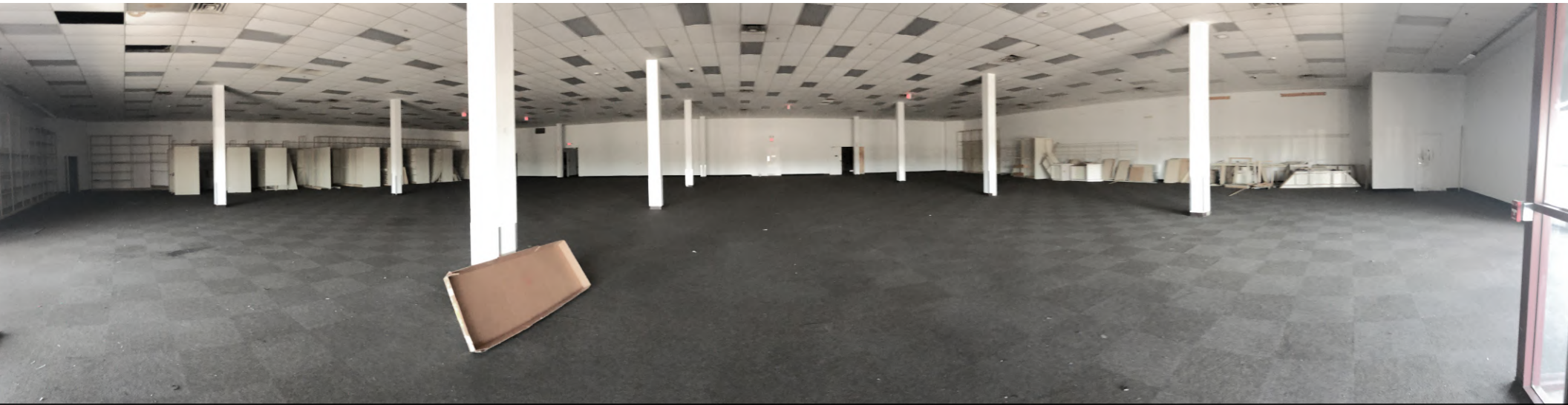
±18,200 Jr Anchor Space