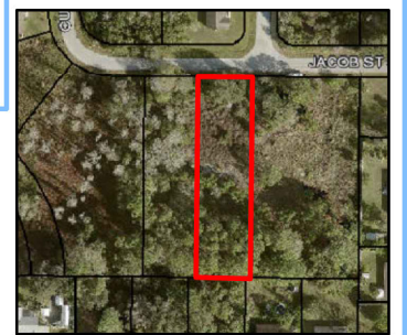
AERIAL PHOTOGRAPH (MAY NOT SHOW LATEST IMPROVEMENTS) (NOT-TO-SCALE)

BEARING REFERENCE: CENTER LINE OF JACOB STREET SOUTHEAST AS S 89°39'30" E ALL BEARINGS SHOWN HEREON REFERENCED THERETO.