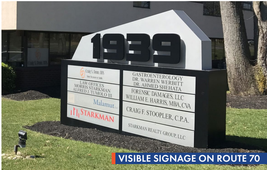
VISIBLE SIGNAGE ON ROUTE 70