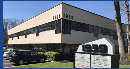
1939 Route 70