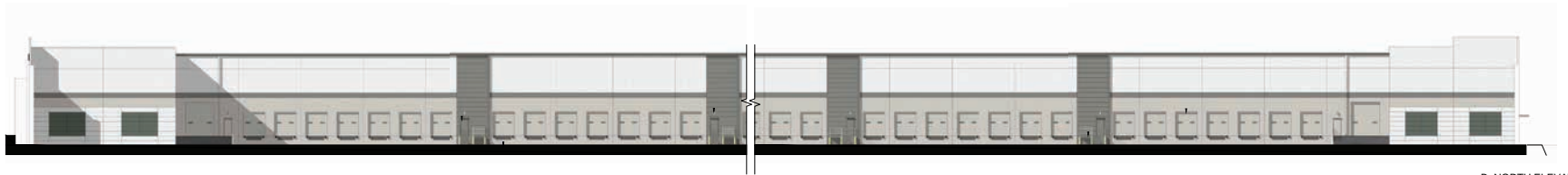
B: NORTH ELEVATION