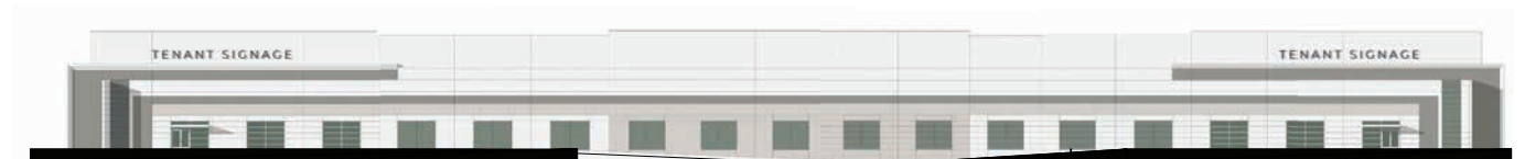
C: EAST ELEVATION