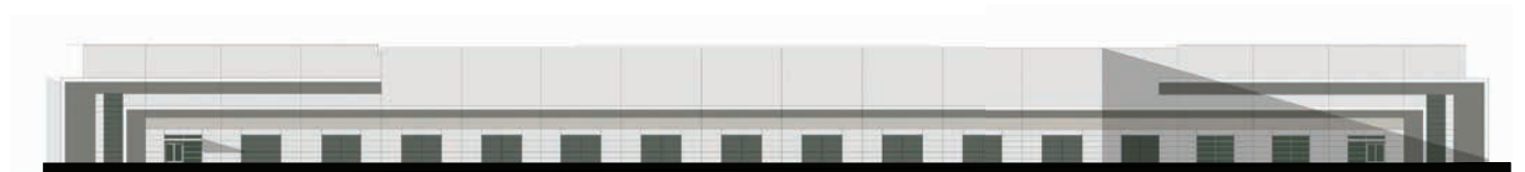
D: WEST ELEVATION