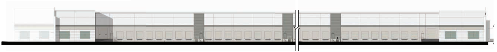
A: SOUTH ELEVATION