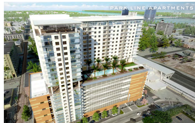
PARK LINE APARTMENTS