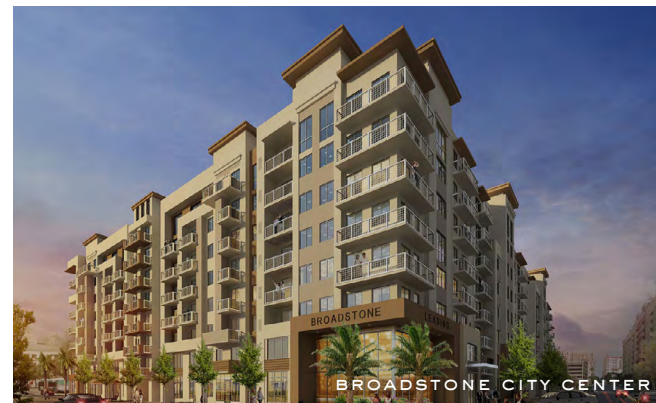
BROADSTONE CITY CENTER