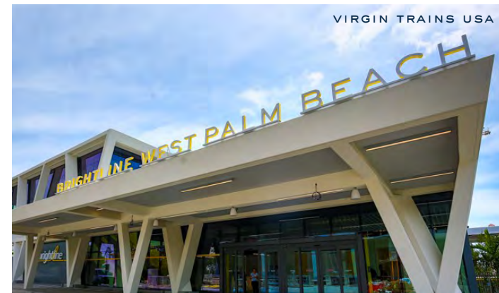
VIRGIN TRAINS USA