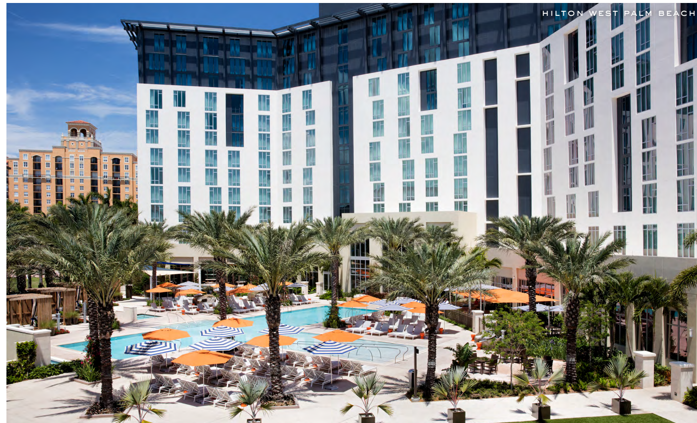
HILTON WEST PALM BEACH