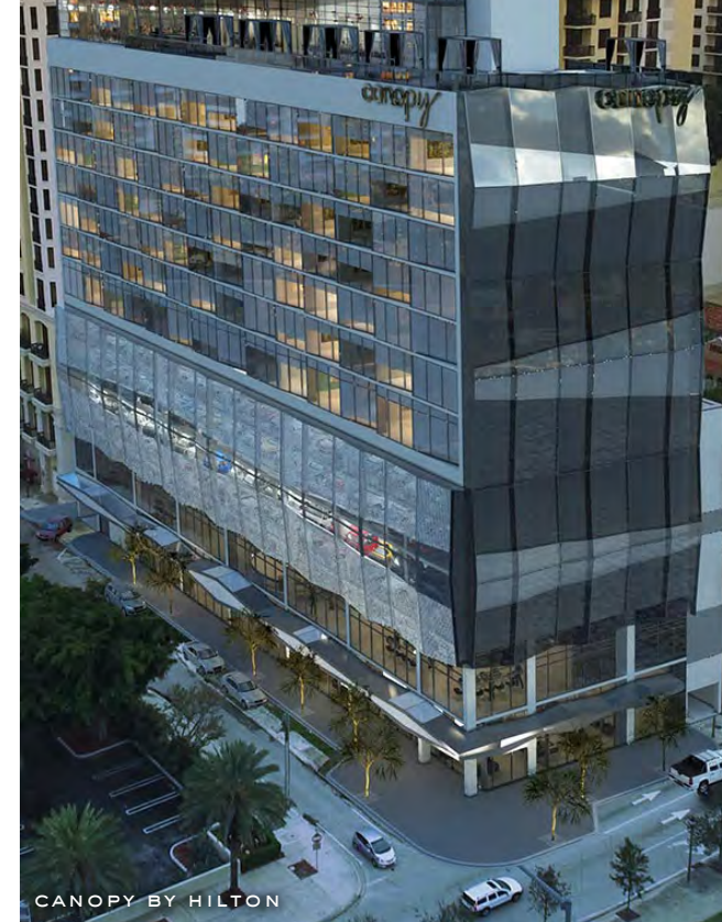
CANOPY BY HILTON