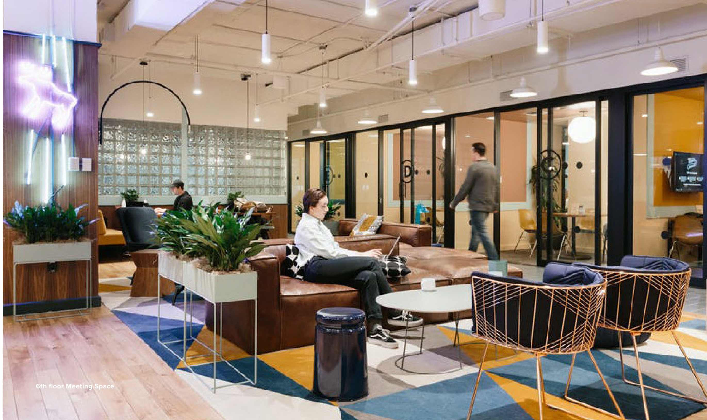
6th floor Meeting Space