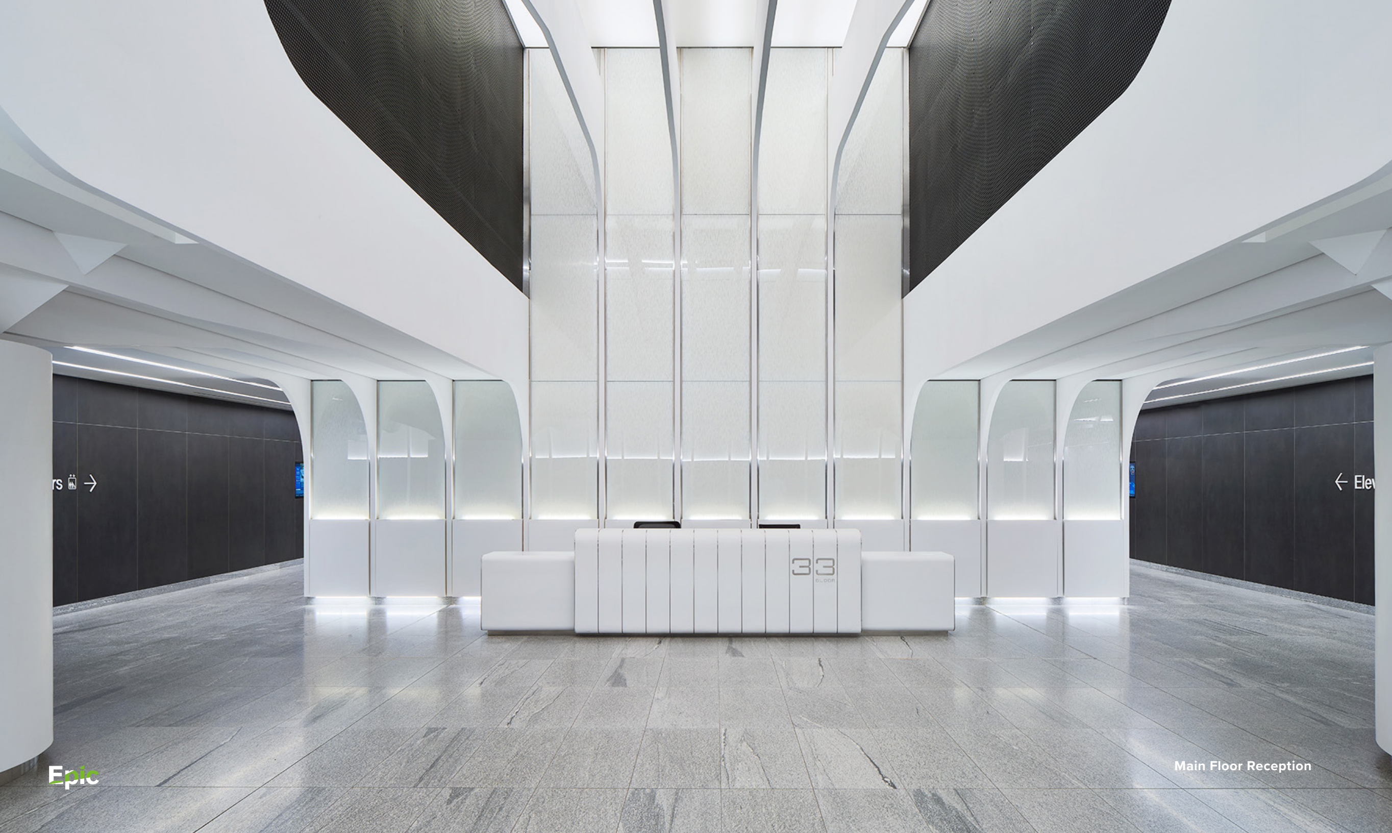
Main Floor Reception