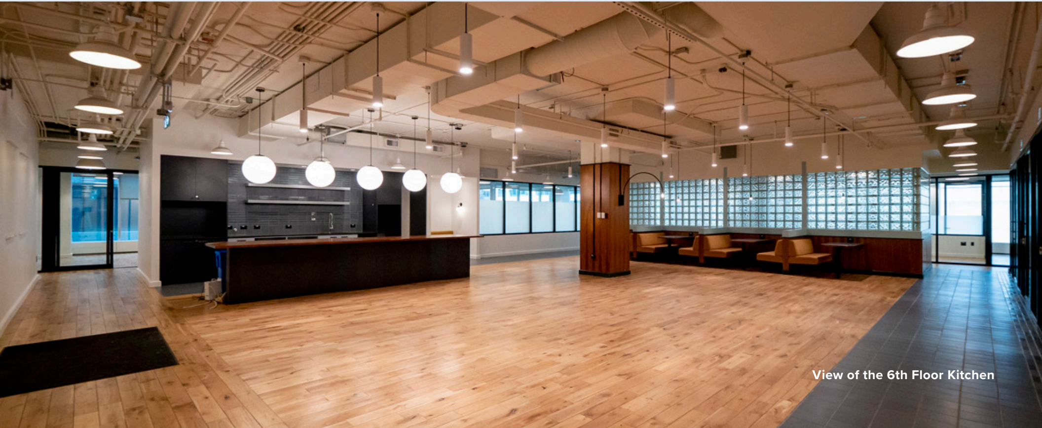
View of the 6th Floor Kitchen