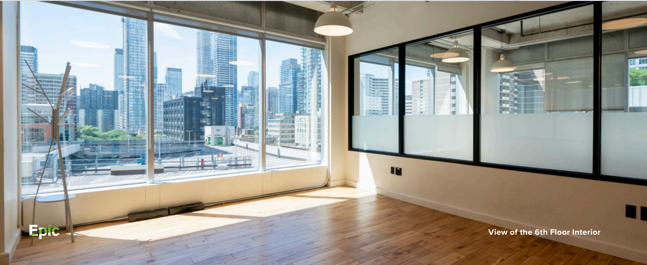
View of the 6th Floor Interior