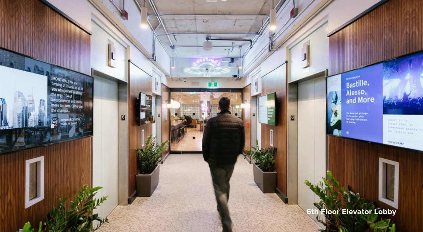
6th Floor Elevator Lobby