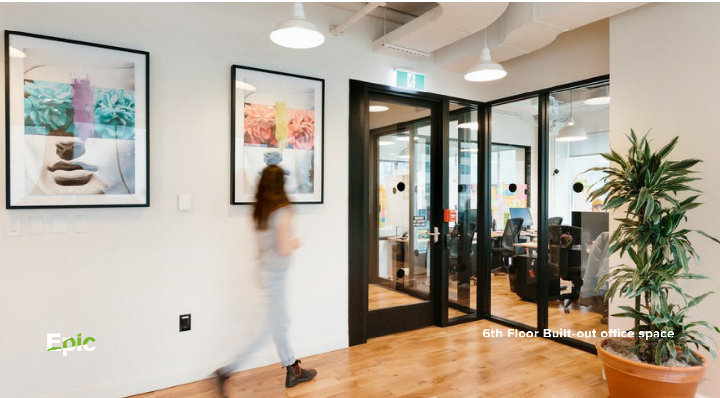
6th Floor Built-out office space