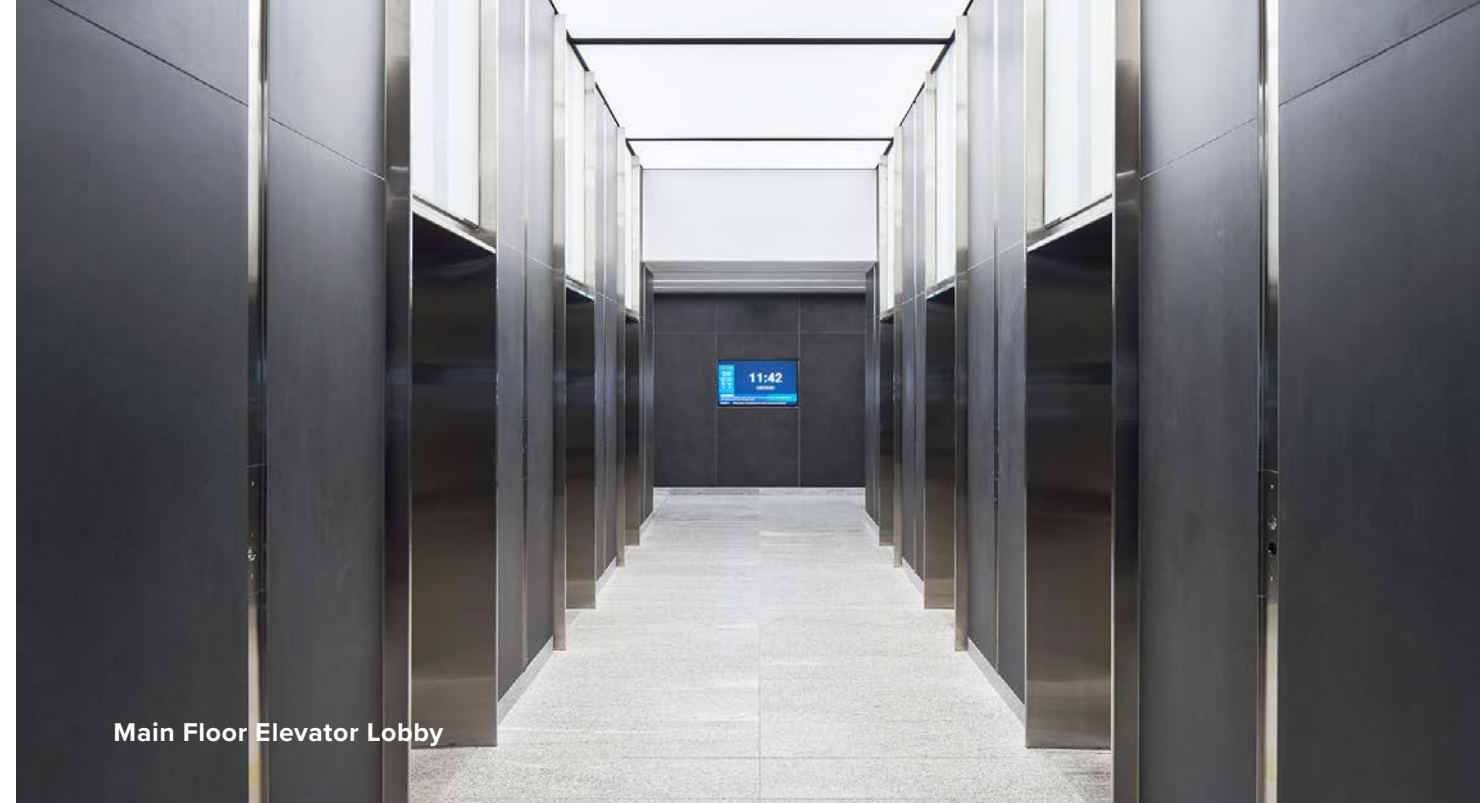
Main Floor Elevator Lobby