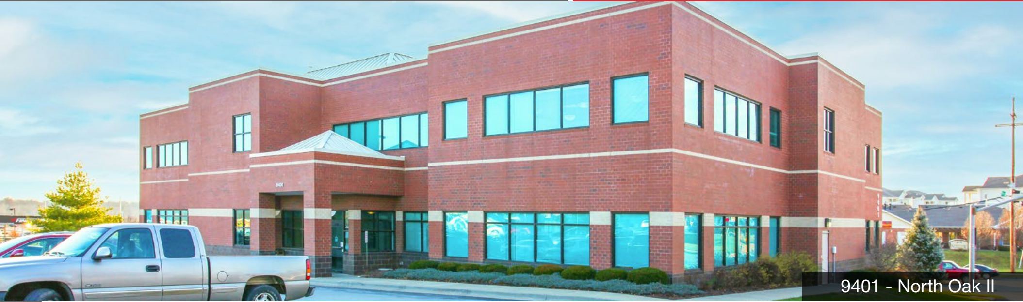
9401 - North Oak II