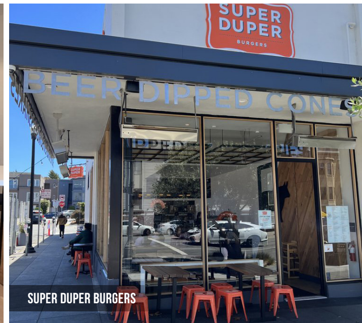
SUPER DUPER BURGERS