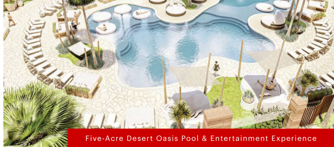
Five-Acre Desert Oasis Pool & Entertainment Experience