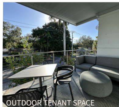
OUTDOOR TENANT SPACE