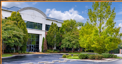
PETER JEFFERSON PLACE VI 650 Peter Jefferson Pkwy