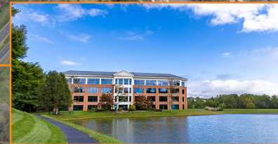
PETER JEFFERSON PLACE I 675 Peter Jefferson Pkwy