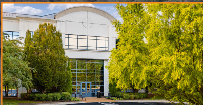
PETER JEFFERSON PLACE VII 652 Peter Jefferson Pkwy