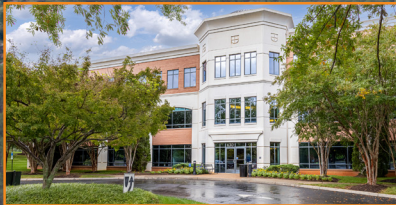
PETER JEFFERSON PLACE II 630 Peter Jefferson Pkwy