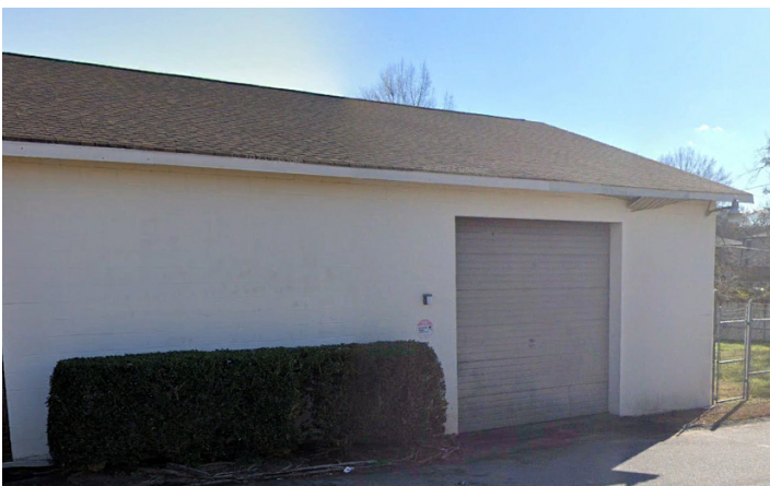
GARAGE DOOR TO STORAGE AREA