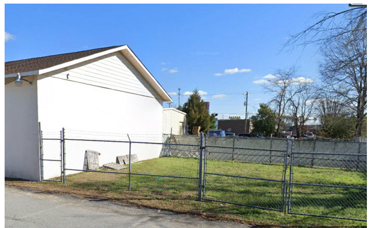
FENCED IN REAR YARD