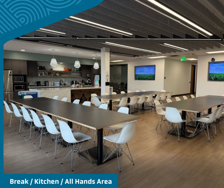
Break / Kitchen / All Hands Area