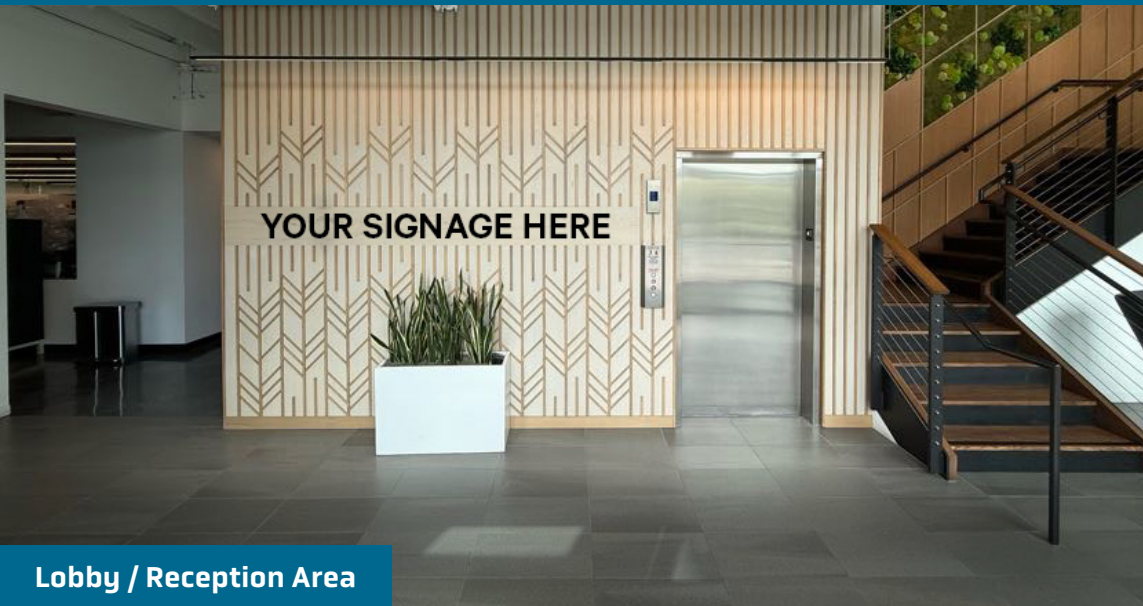
Lobby / Reception Area