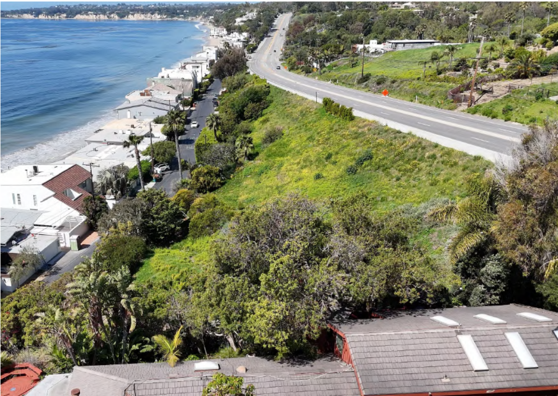
Vacant Land | 4460-027-010