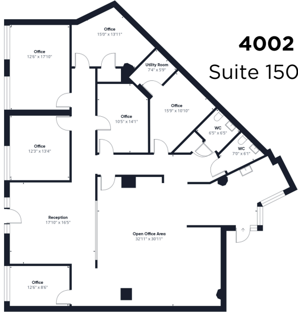
4002 Belt Line Suite 150 - 2,588 RSF