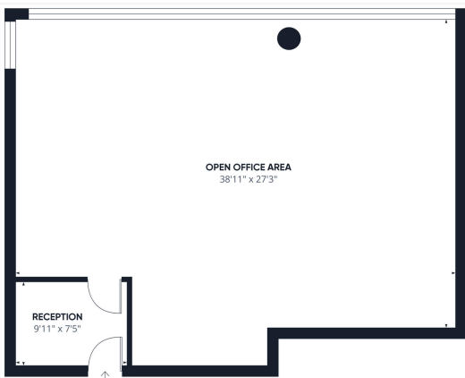
4006 Belt Line Suite 140 - 1,333 RSF