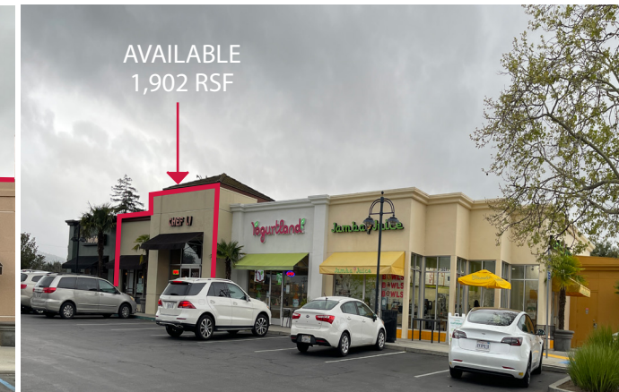
1,902 RSF Space