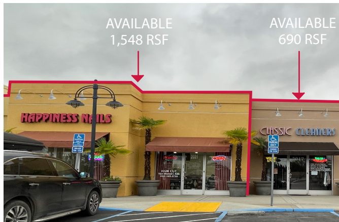
690 RSF Space & 1,548 RSF Space