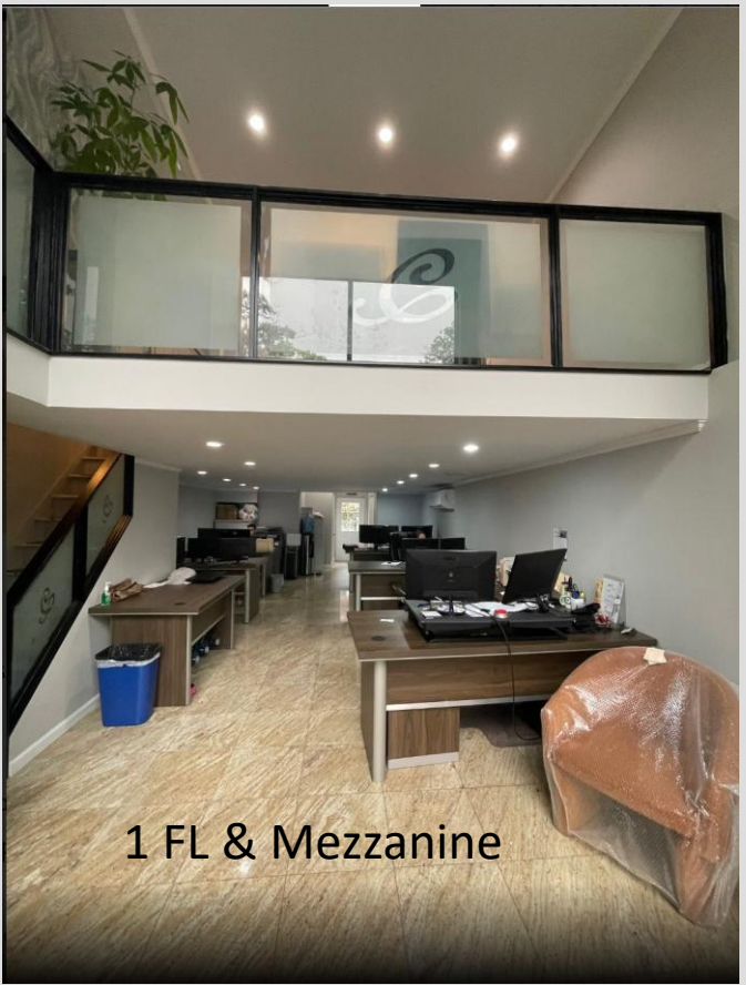
1 FL & Mezzanine