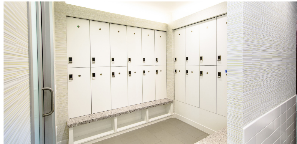
Fitness center locker rooms