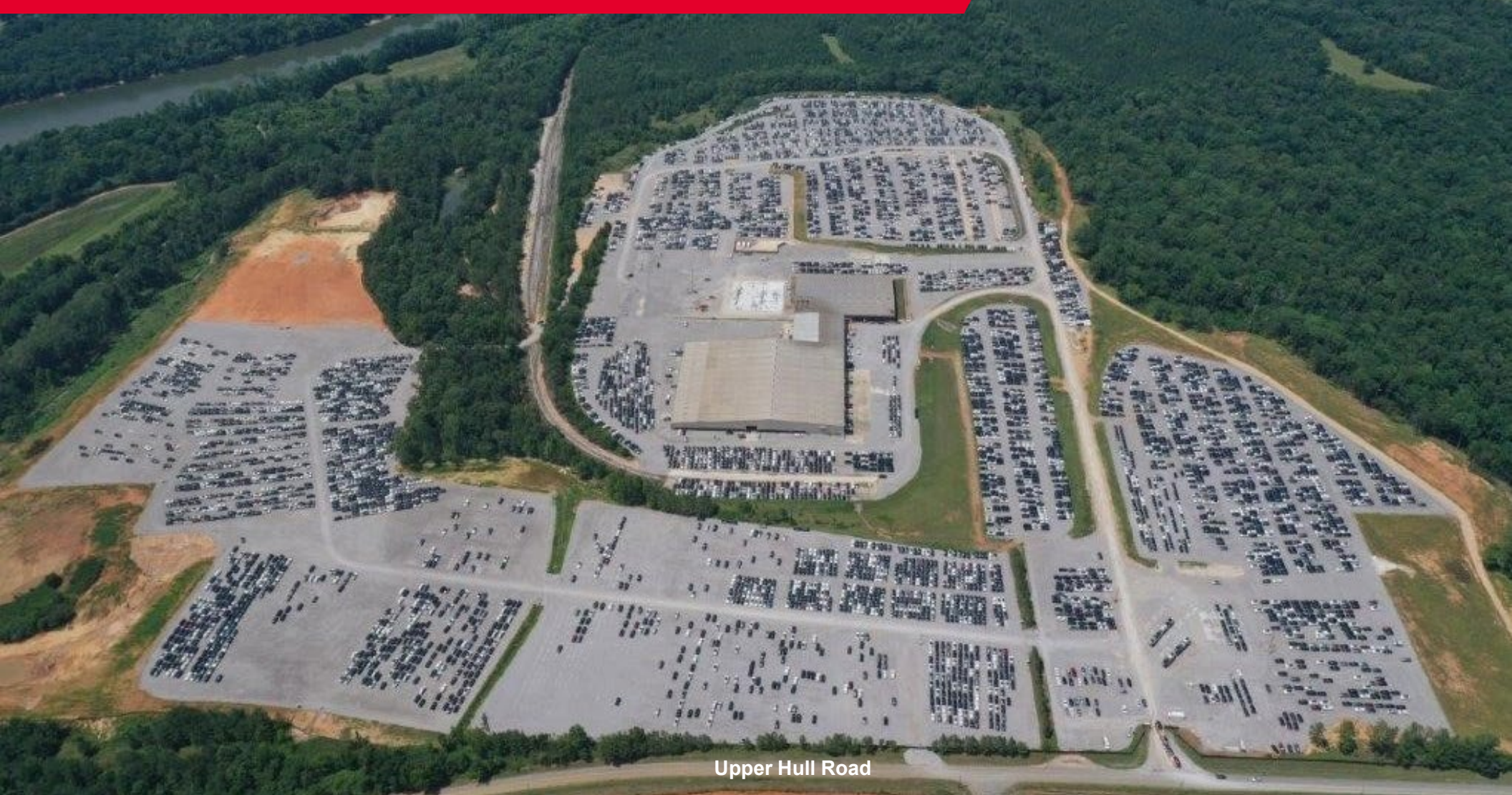
Upper Hull Road

FOR SALE 12068 Upper Hull Road Tuscaloosa, Alabama