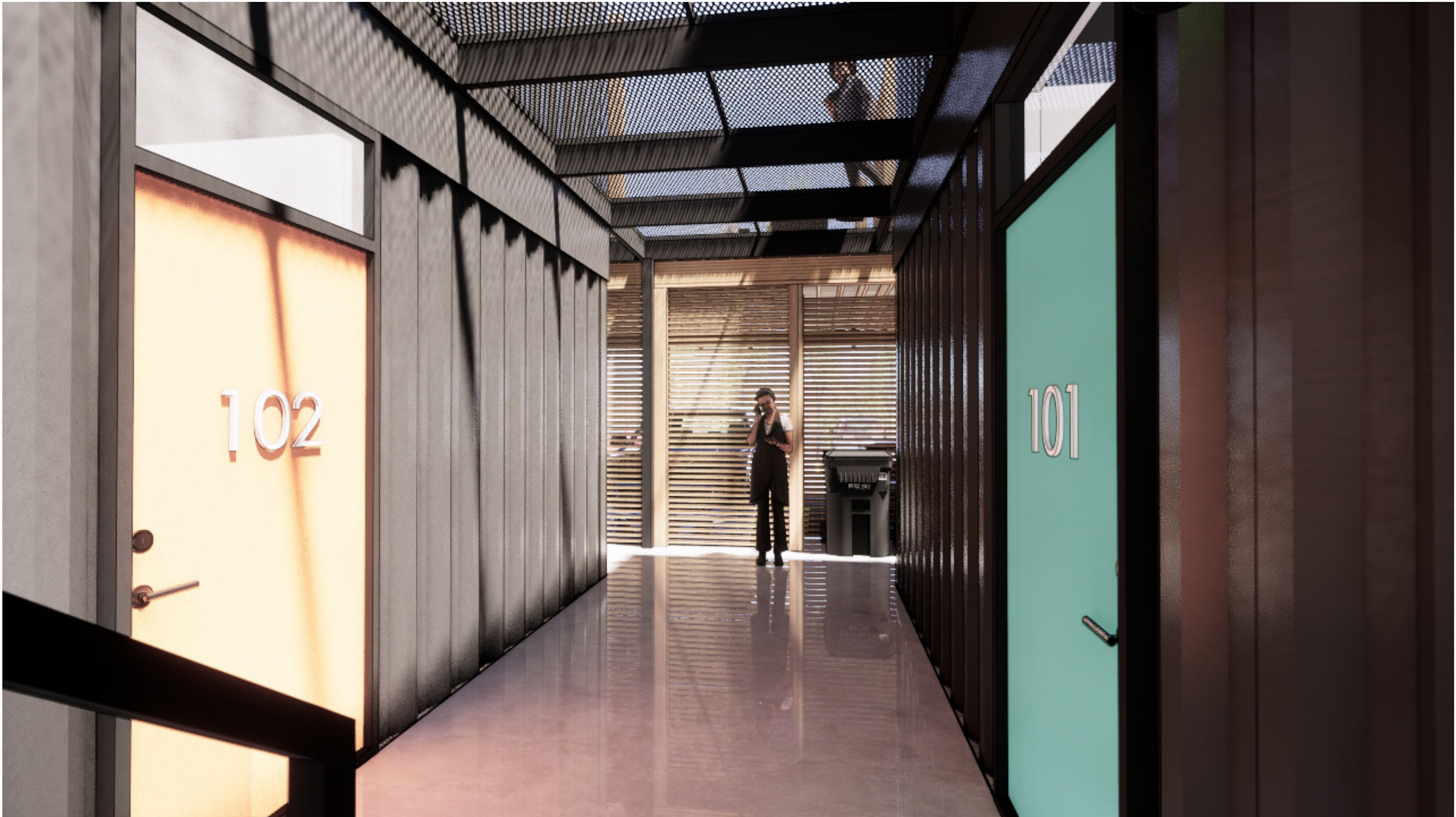
Ground Level Exterior Corridor