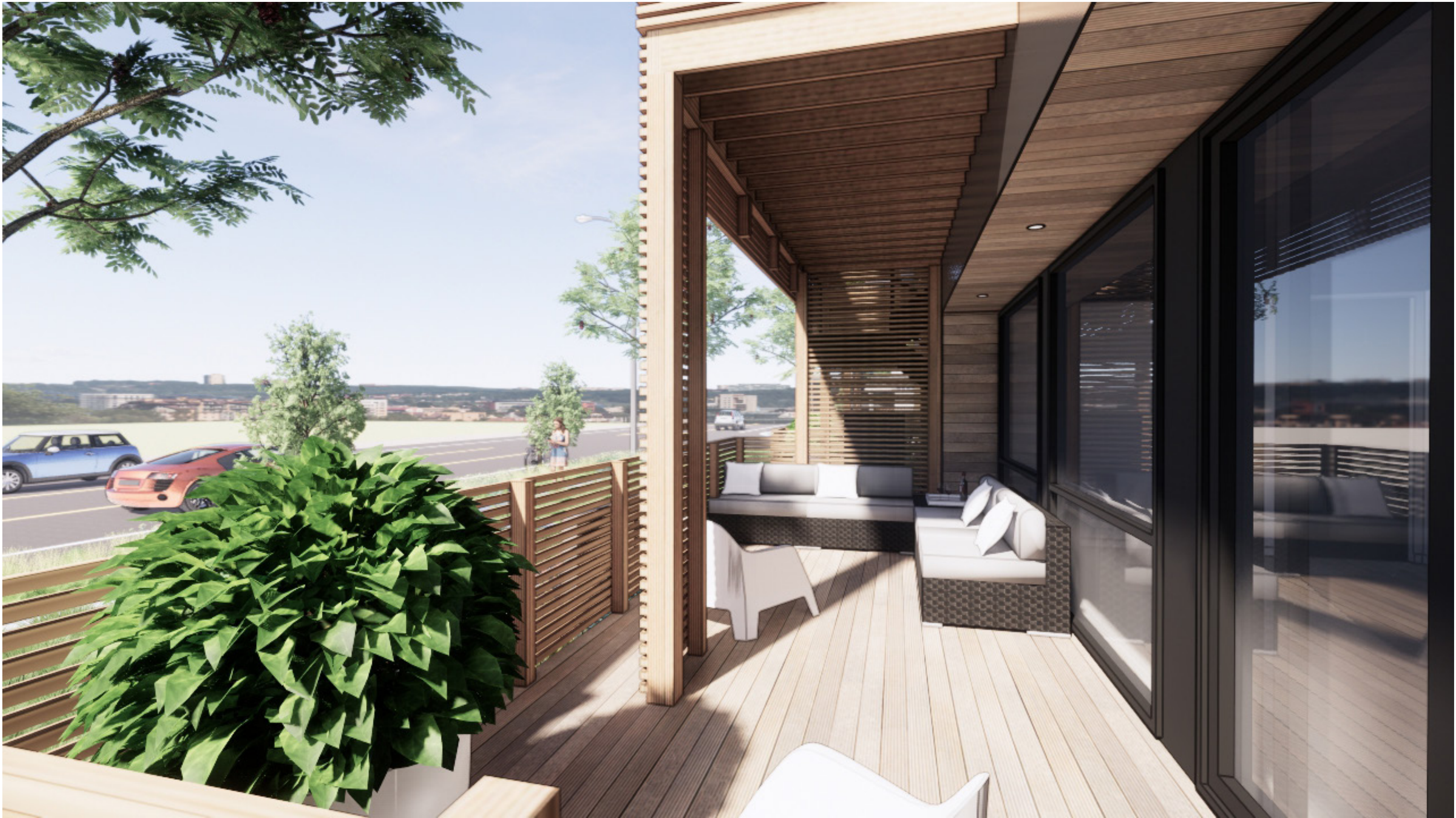
Unit 101 Deck