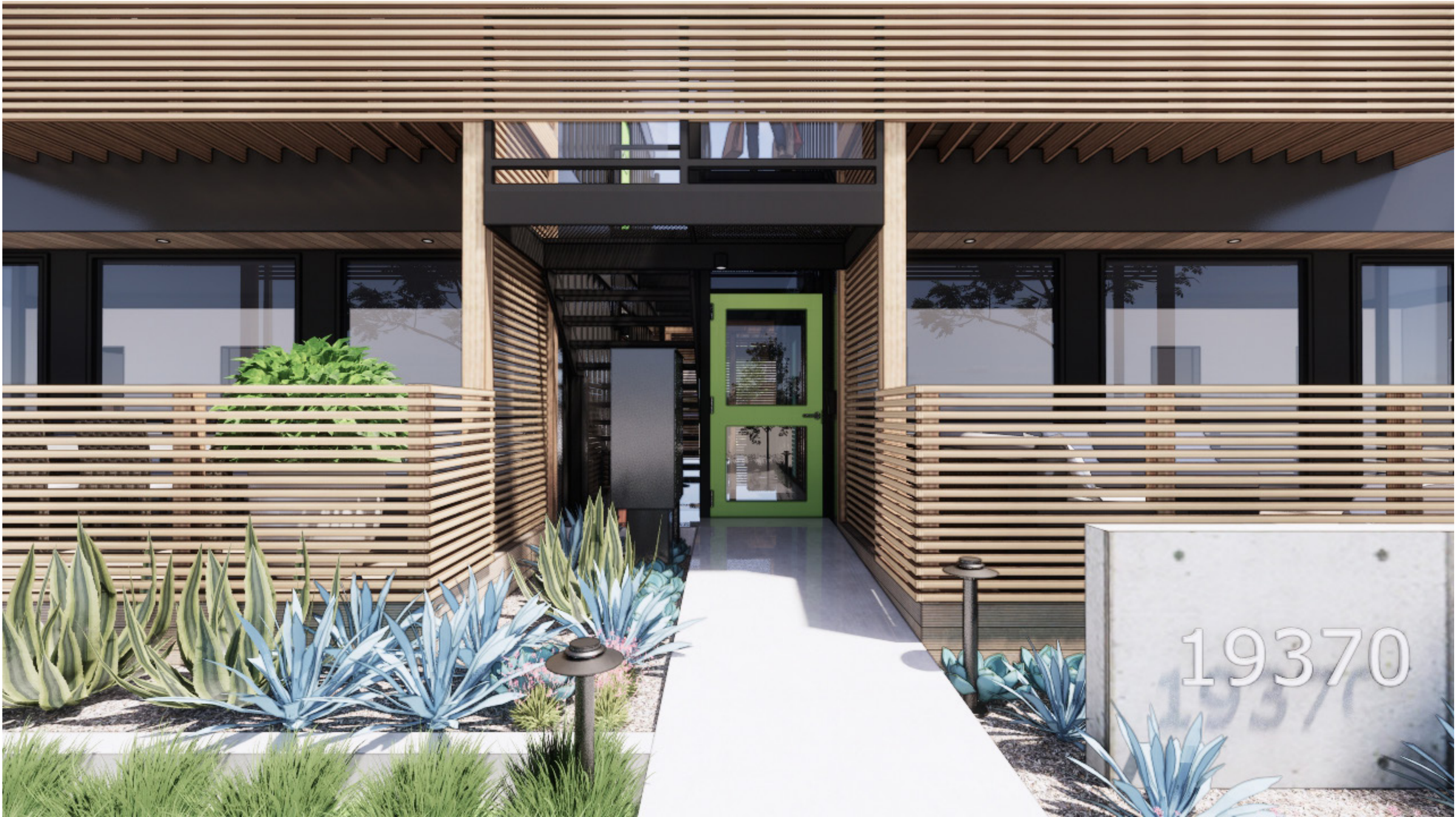
Building Front Entrance