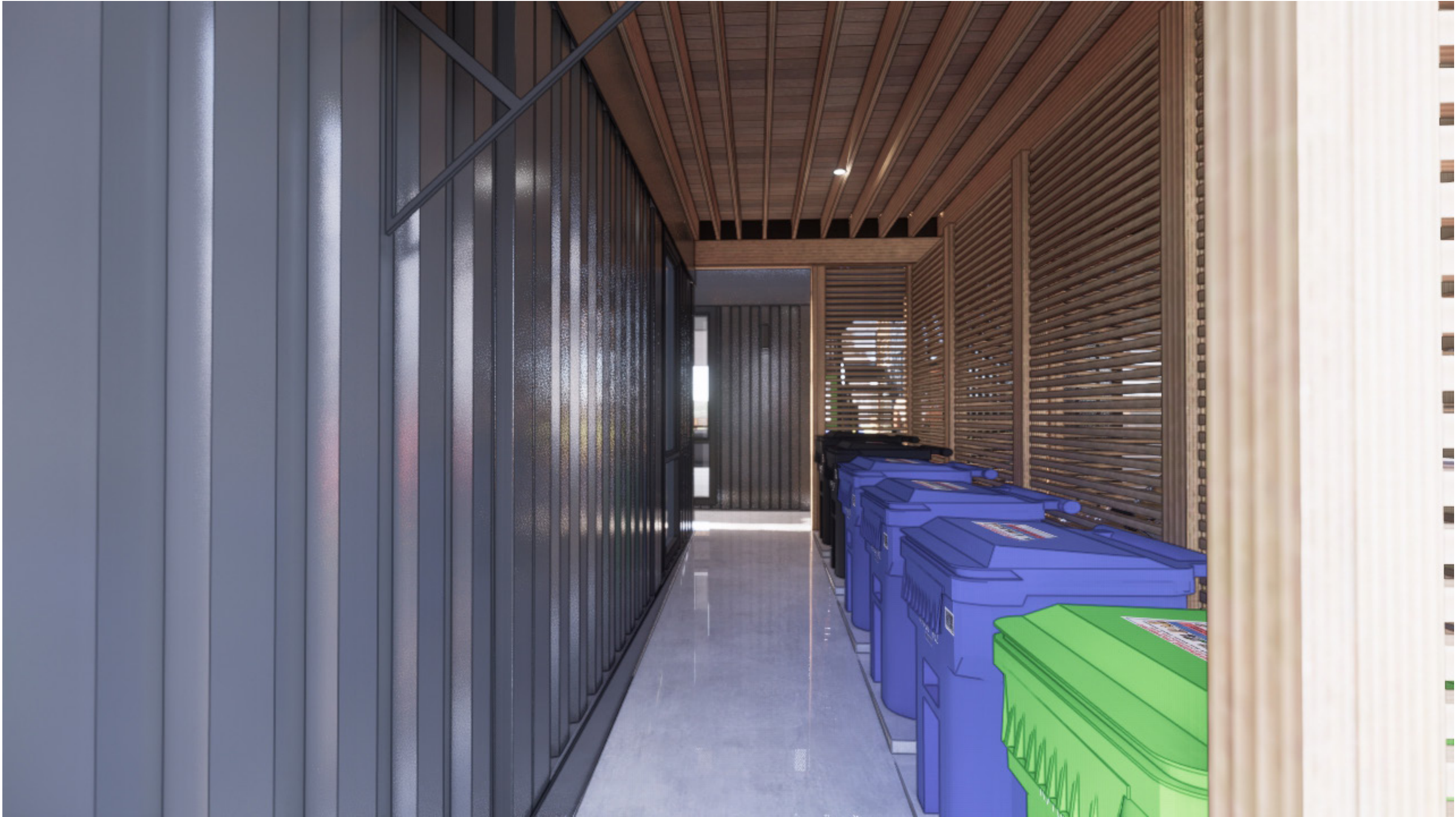
Parking Walkway - Waste Collection Area