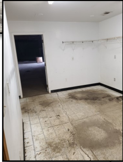
(3) 9'H x 10'W O/H Dock Doors