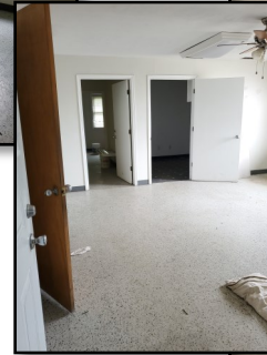
(2) 9'H x 10'W O/H Dock Doors