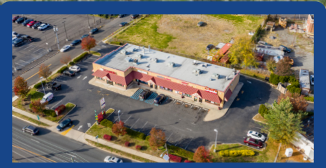
201 ROUTE 130